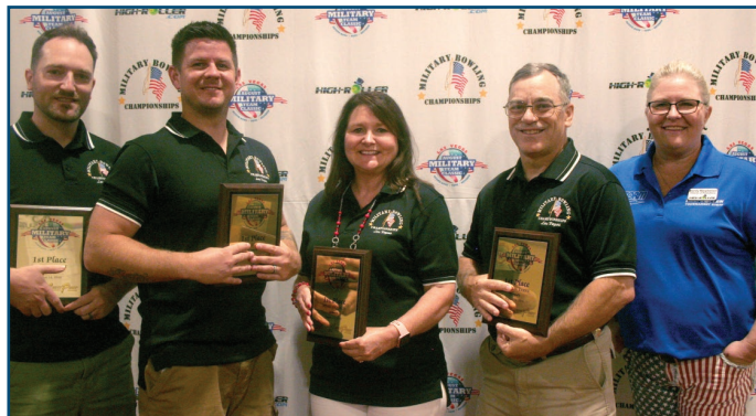
Team Hawgs will be back in 2021 to defend their title!

Each squad will have its own Mystery Score. Cost is just $15 prepaid for all 3 events and it will pay out THOUSANDS OF $$$! After each squad, a score will be pulled from the Mystery Score bag. If you bowled that game in your 2nd game – the pot is yours! We will keep pulling a game until it is hit each squad! Must be entered prior to bowling any of the main events.