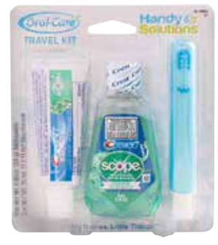
Dental Travel Kit Item No. 1749