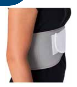
Rib Belt - Female (one size fits most) Item No. 1457