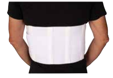
Back Support Elastic with Lumbar Item No. 1488