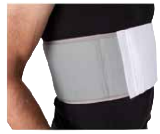
Rib Belt - Male (one size fits most) Item No. 1456