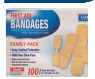
Adhesive Bandages Item No. 1344 $500