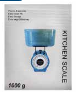
Scale, Kitchen, Dial ‡ Item No. 1756