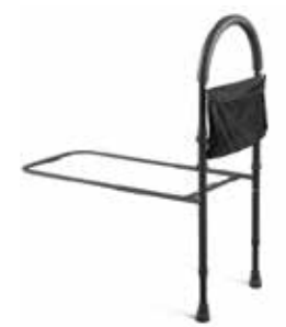
Bed Assist Bar Item No. 2009