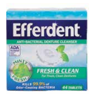
Efferdent® Plus Mint Tablets Item No. 1653