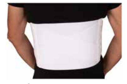
Back Support Elastic - 24" to 46"