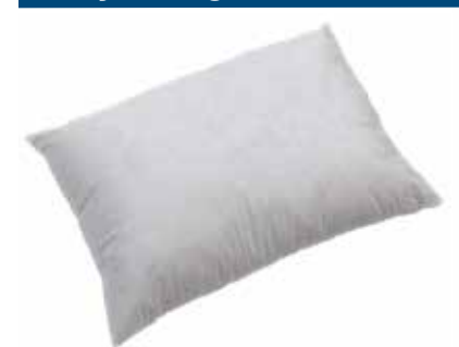
Pillow, Hypoallergenic Item No. 1936