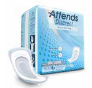
Attends® Discreet Men's Guard Item No. 1811