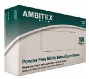
Nitrile Exam Gloves Item No. 1840