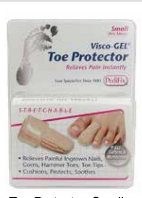
Toe Protector, Small Item No. 1788 $9 00