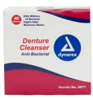
Denture Cleaning Tablets Item No. 1032