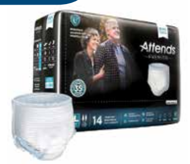
Premier® Disposable Underwear, X-Large - 56" to 68" Item No. 1992