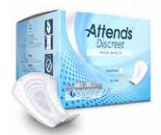
Attends® Discreet Men's Shield Item No. 1810