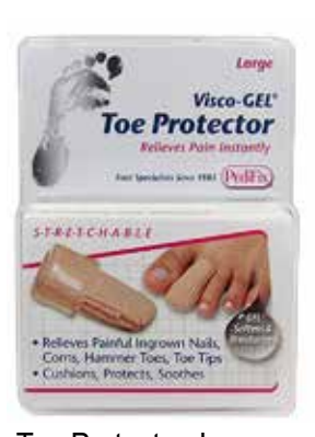
Toe Protector, Large Item No. 1787 $900