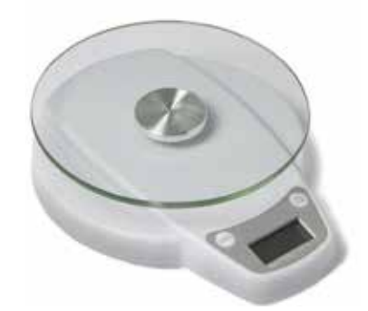
Scale, Kitchen, Digital ‡ Item No. 2016