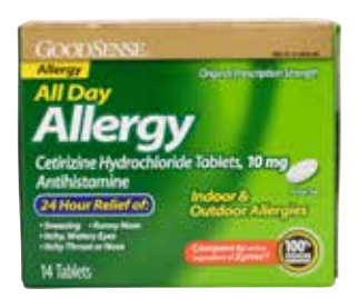
Cetirizine HCL (Allergy Tablets) Item No. 1090