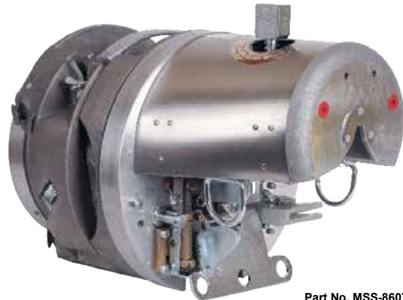
Part No. MSS-8670