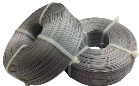
Part No. MSS-71542