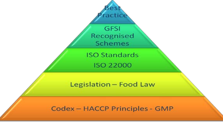
Figure 1: the elements that GFSI recognised schemes are built on, including the foundation of legal, regulatory requirements and Codex principles.

In 2009 GFSI commissioned a report to compare the GFSI Guidance Document, GFSI recognised schemes and the Codex General Principles of Food Hygiene Code of Practice. The key elements defined by the Codex Code of Practice to control risk factors throughout the production of food are found in the GFSI Guidance Document and the GFSI recognised schemes. The comparison document can be found at www.mygfsi.com. The comparison demonstrates convergence between the schemes with a strong foundation in food safety controls that are internationally recognised by both the industry and governments.