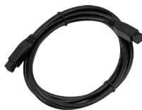
FireWire 800 (1394b) 9-9 pin cable