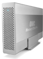
Mercury Elite Pro (with vertical stand)