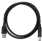
USB 3.0 cable (Standard-A to Standard-B)