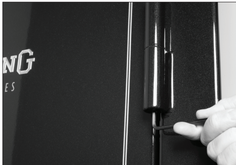
Use an Allen wrench to adjust the door height.

the Allen bolt counterclockwise (looking down at the hinge) raises the door on its hinges. Both Allen bolts (top and bottom hinges) should be turned the same amount when adjusting the door.