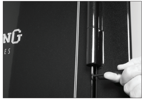
Use an Allen wrench to adjust the door height.

the Allen bolt counterclockwise (looking down at the hinge) raises the door on its hinges. Both Allen bolts (top and bottom hinges) should be turned the same amount when adjusting the door.