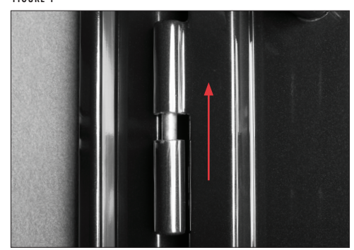
The door must be clear of frame for removal. Lift straight up to avoid damaging bolts.