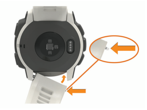
NOTE: Make sure the band is secure. The watch pin should align with the holes on the device.

To install QuickFit 22 bands, remove the watch pin from the Instinct band, replace the watch pin on the device, and press the new band into place.