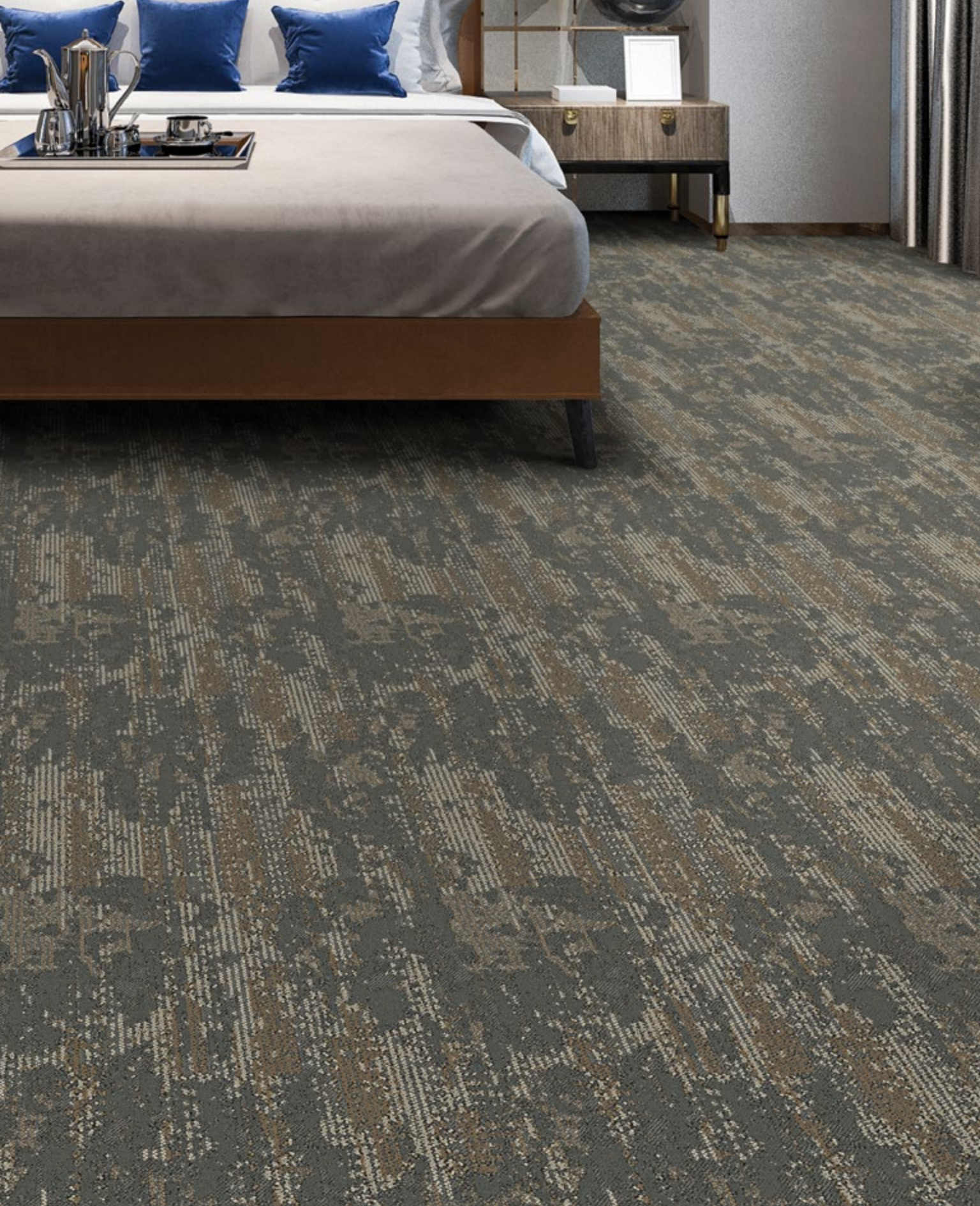
HC020 BROADLOOM 12' W | PATTERN REPEAT 24" W X 36" L