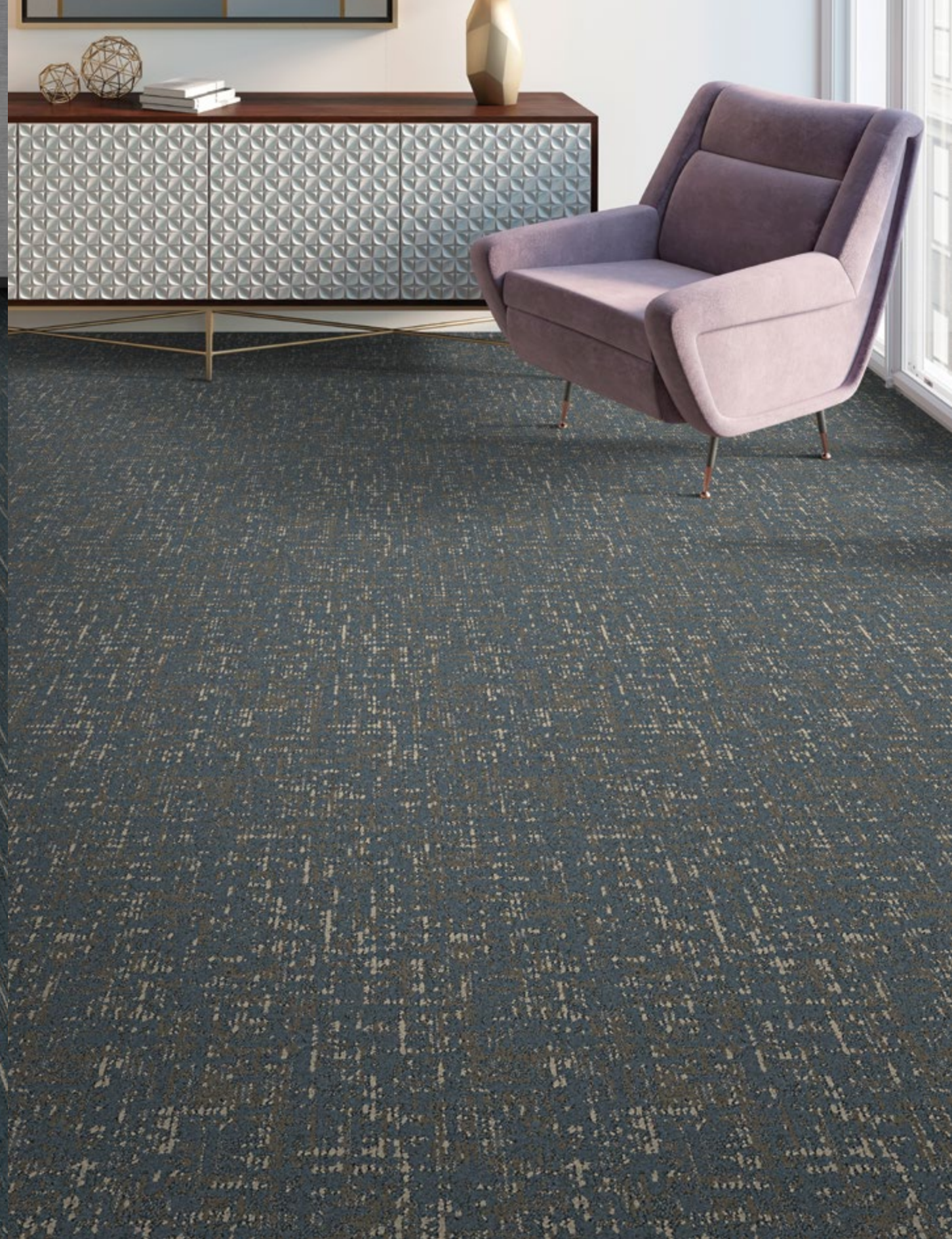
BOUCLE | 4504 HARMONY