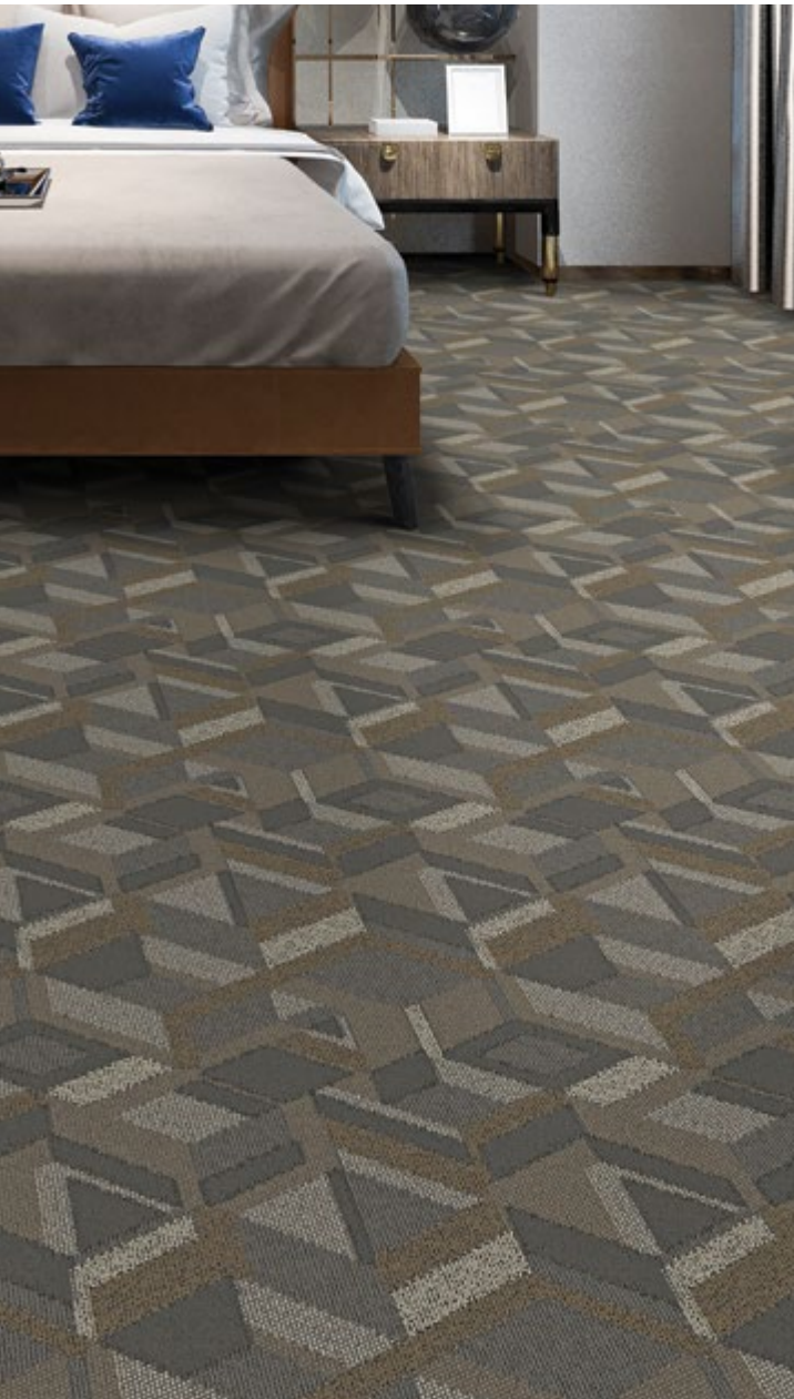
CUSTOM PATTERN OPTION HC023

Signature is known for its dedication to helping customers achieve their unique vision for senior living and hospitality environments. We understand that you are incredibly busy and constantly have tight project timelines. So we offer a customization process that is fast, easy and doesn't require you to compromise your design vision to meet your deadlines.