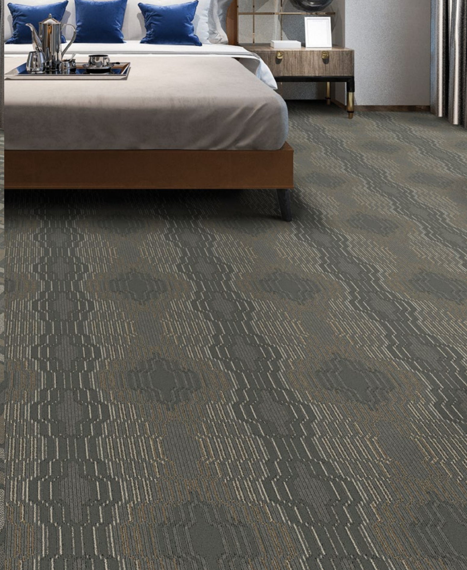
HC025 BROADLOOM 12' W | PATTERN REPEAT 24" W X 27" L