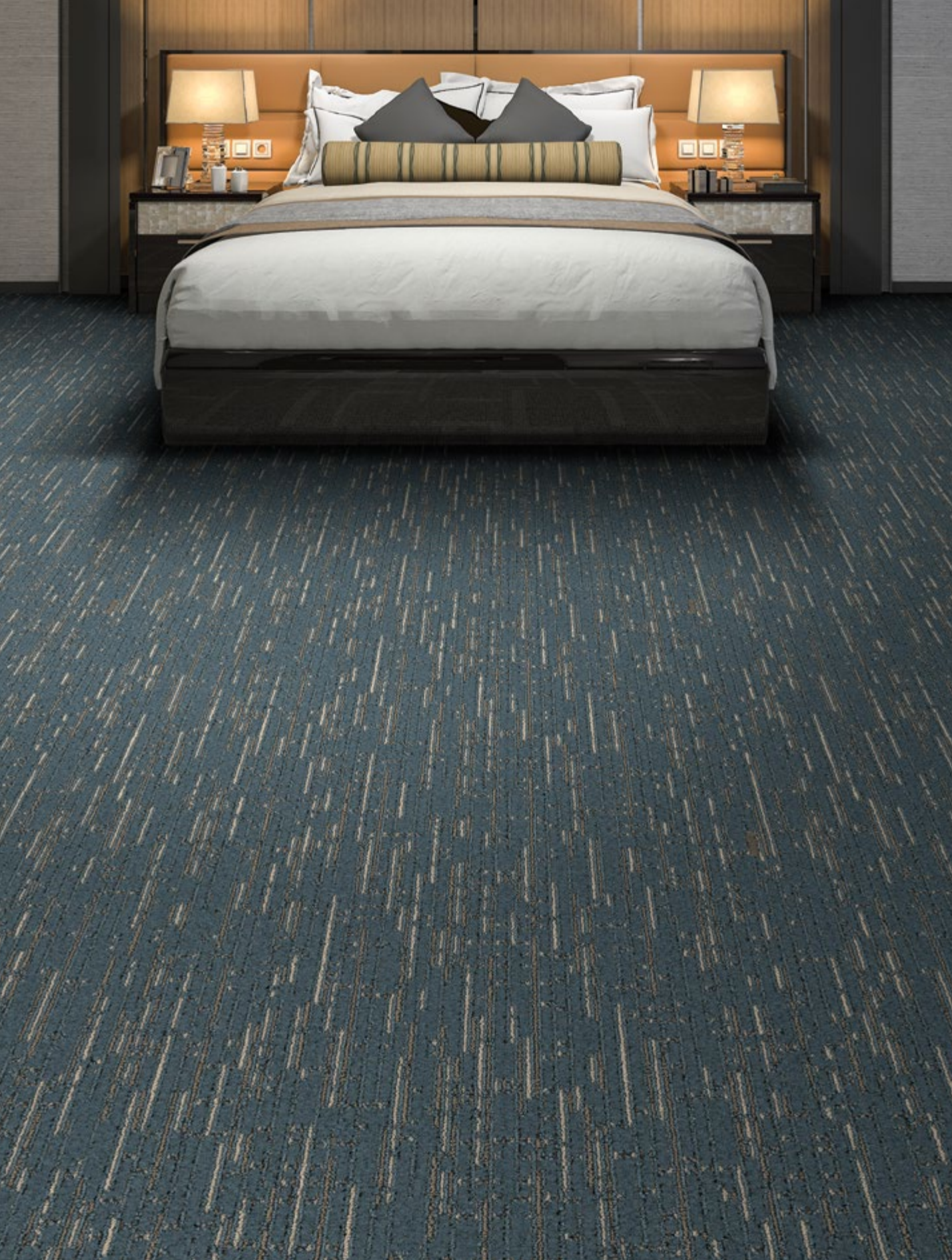
OXFORD | 4504 HARMONY