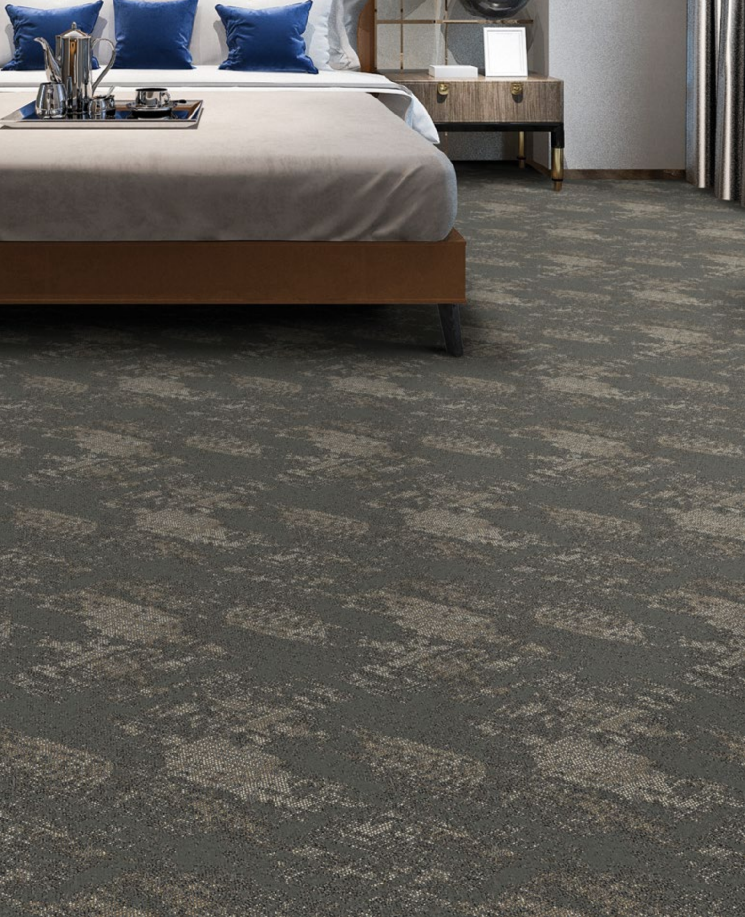
HC027 BROADLOOM 12' W | PATTERN REPEAT 24" W X 32" L