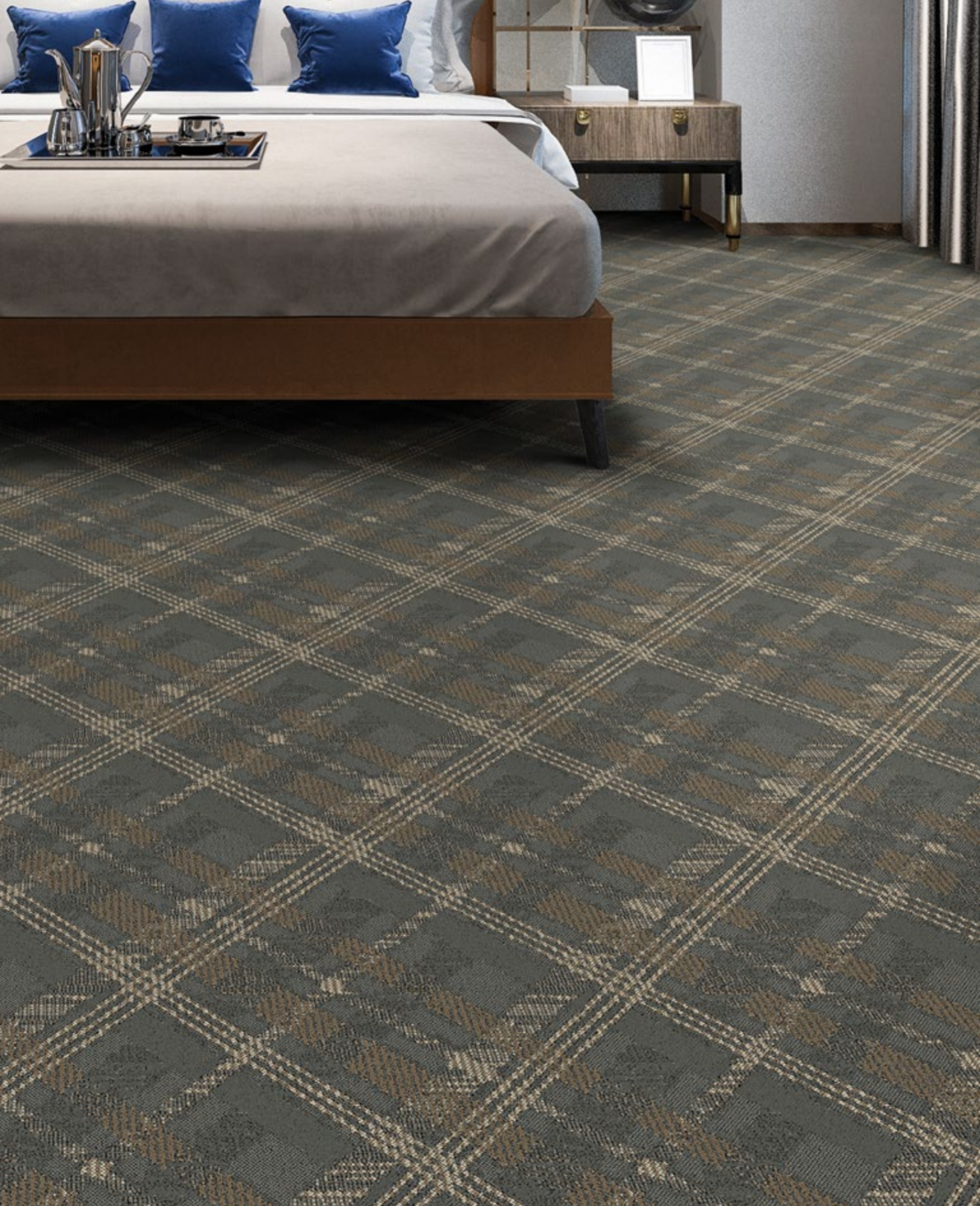
HC021 BROADLOOM 12' W | PATTERN REPEAT 24" W X 24" L