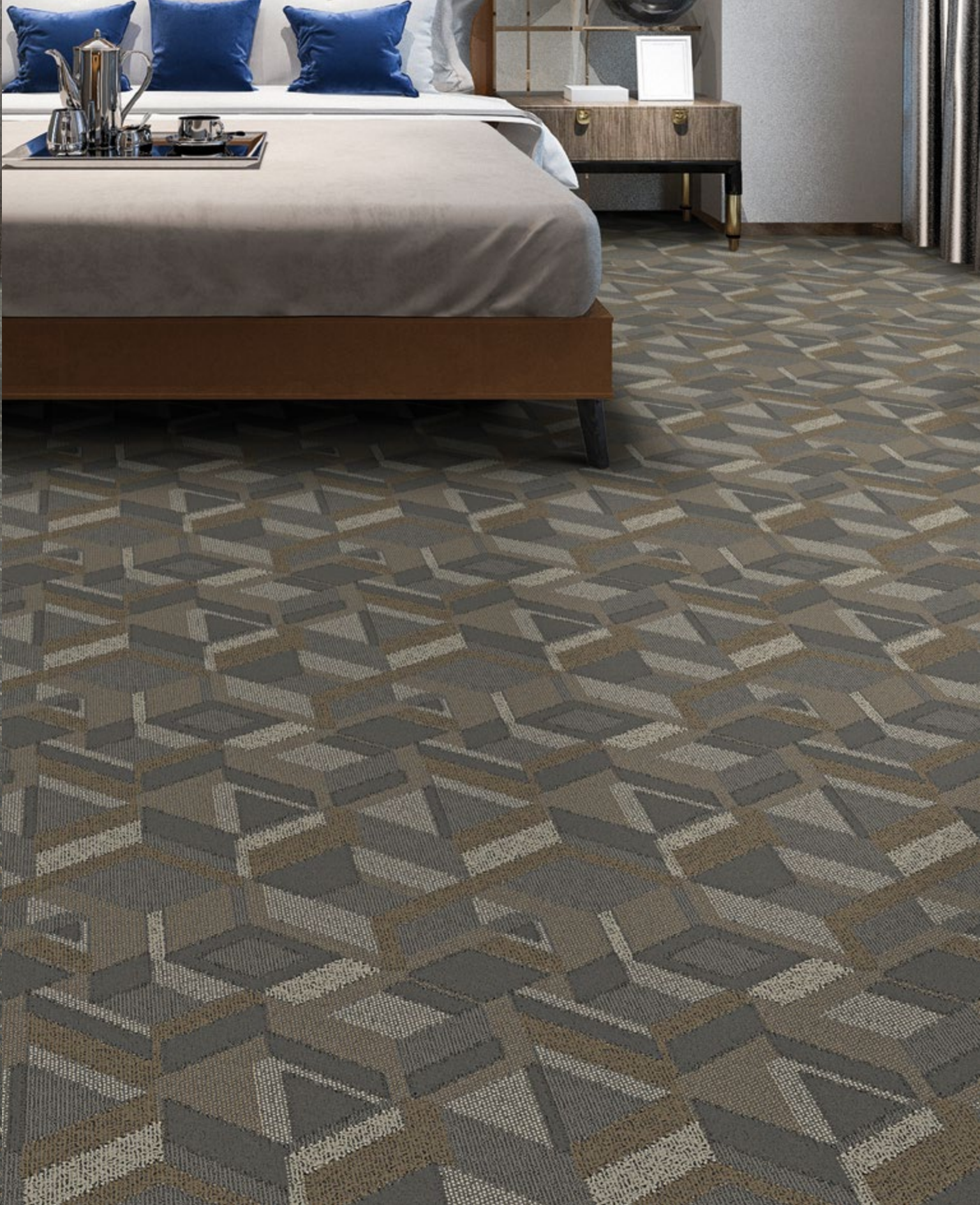
HC023 BROADLOOM 12' W | PATTERN REPEAT 24" W X 24" L