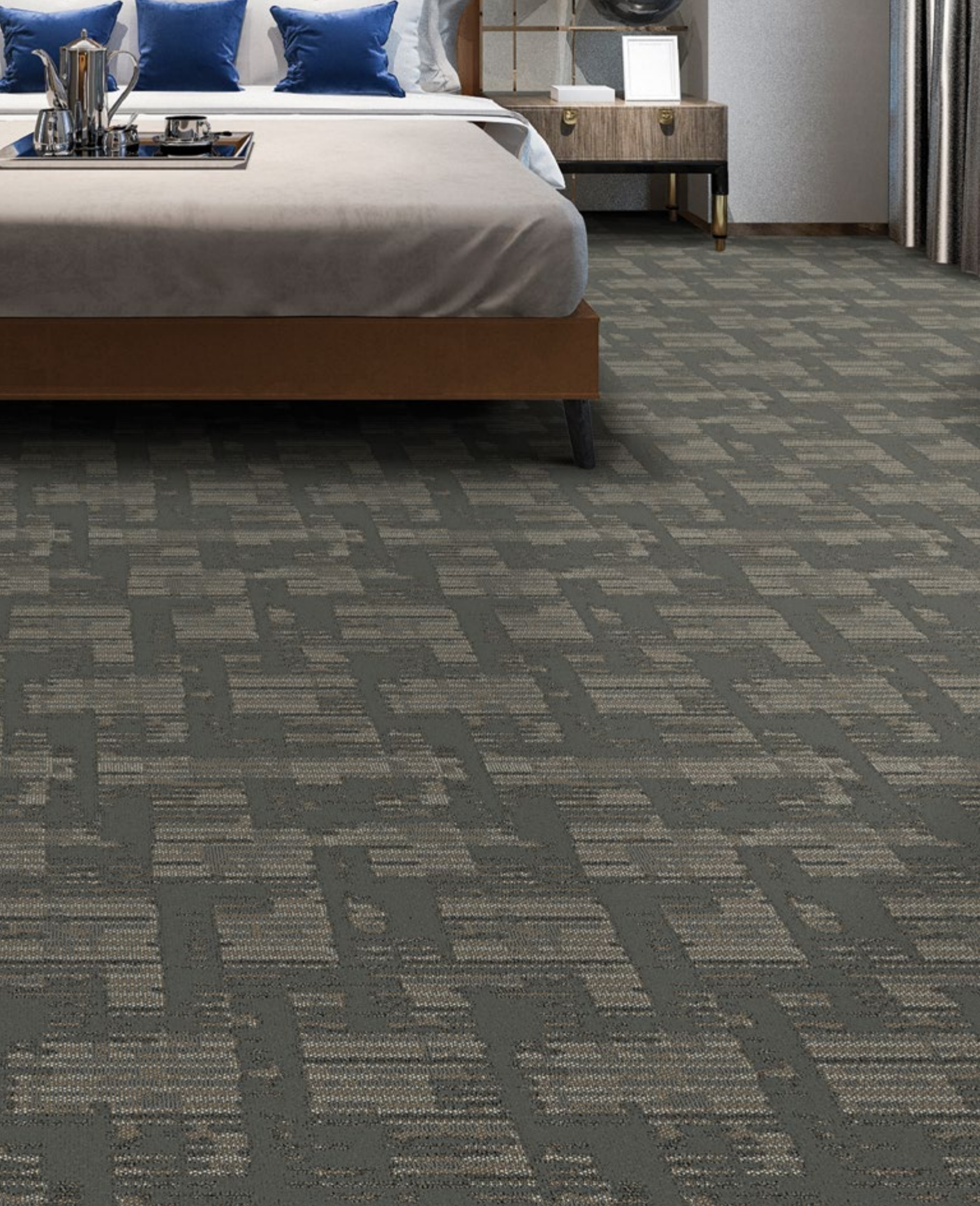
HC026 BROADLOOM 12' W | PATTERN REPEAT 24" W X 36" L