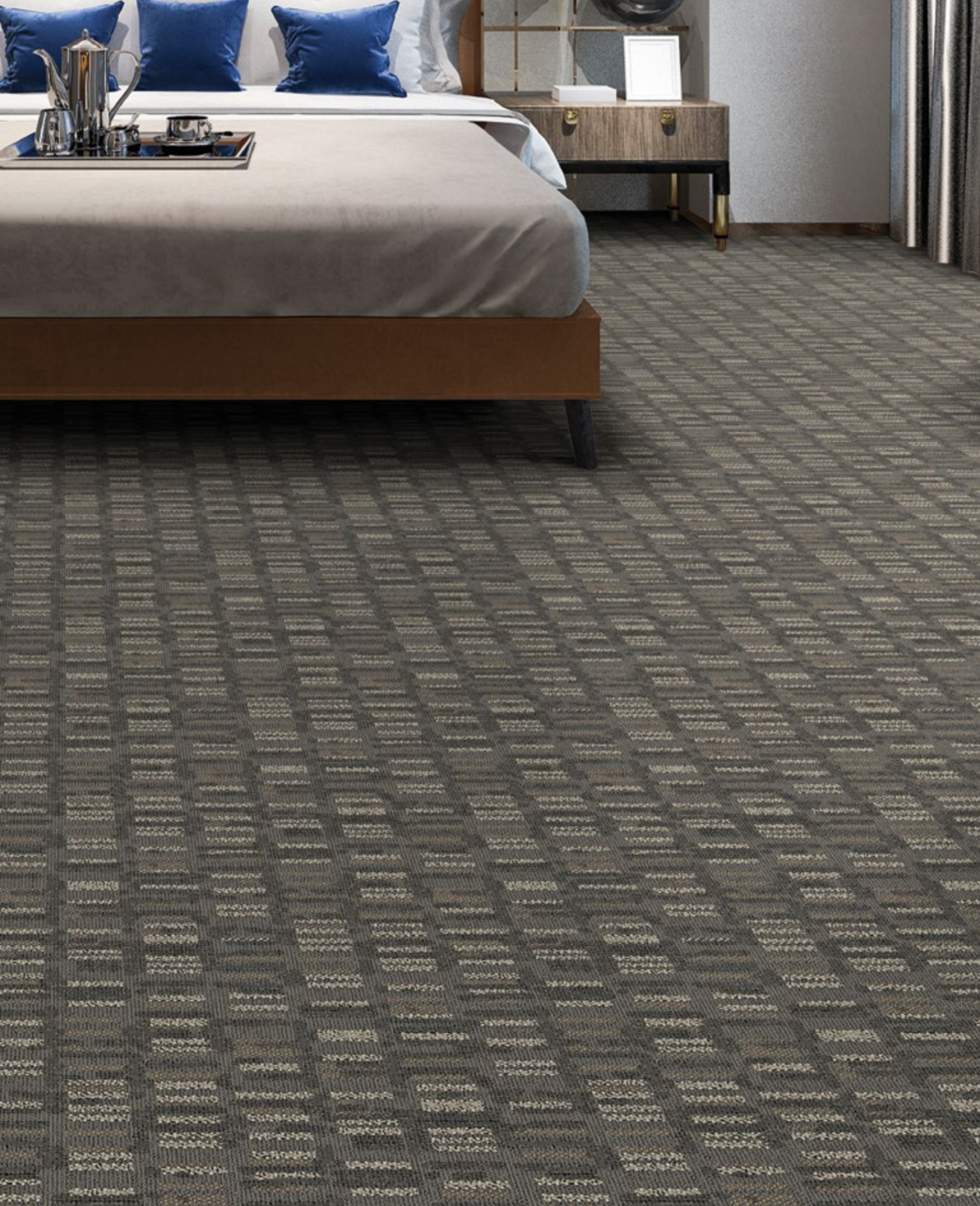
HC0028 7503 HALCYON BROADLOOM 12' W | PATTERN REPEAT 24" W X 24" L