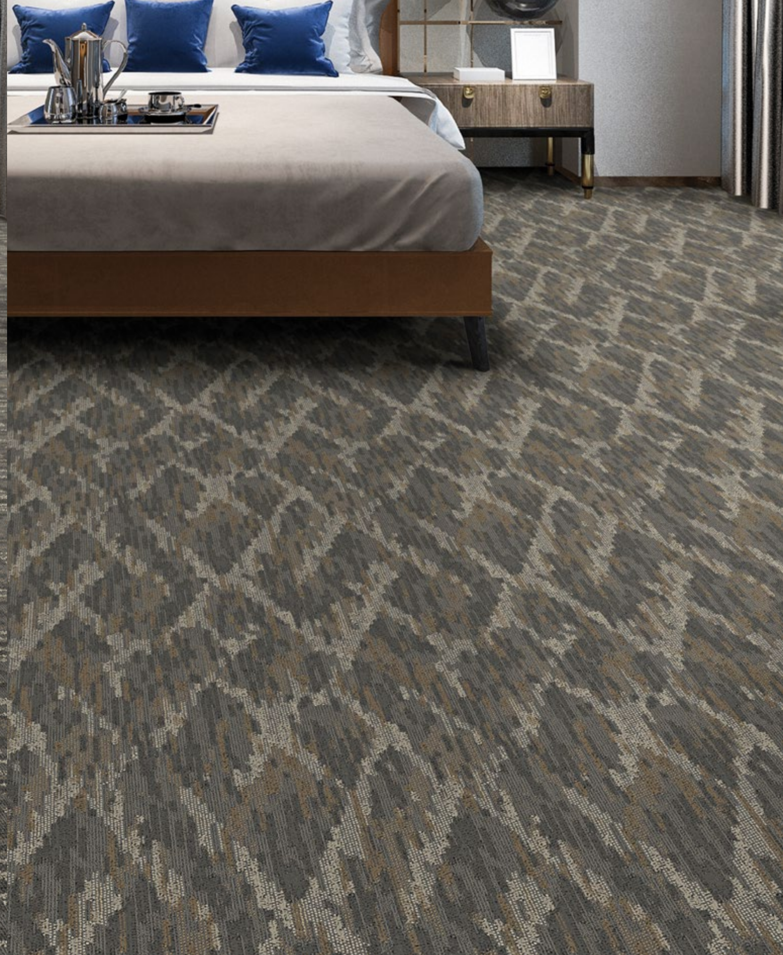
HC029 BROADLOOM 12' W | PATTERN REPEAT 24" W X 36" L