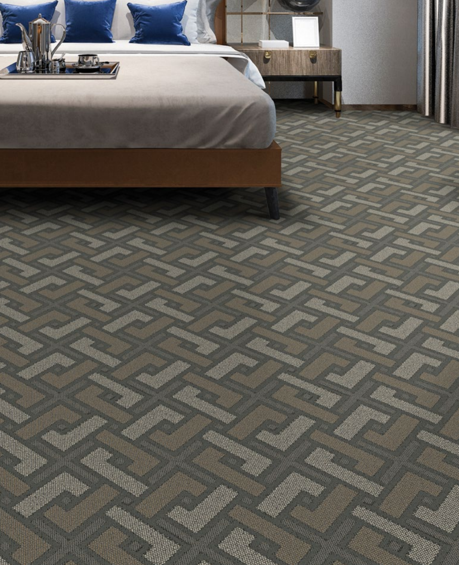
HC024 BROADLOOM 12' W | PATTERN REPEAT 24" W X 24" L