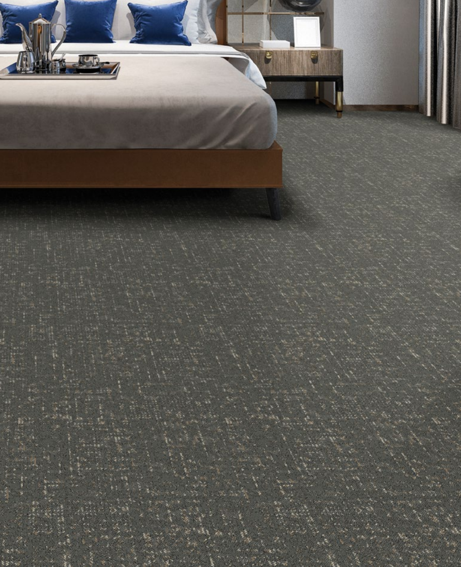
HC022 BROADLOOM 12' W | PATTERN REPEAT 24" W X 36" L