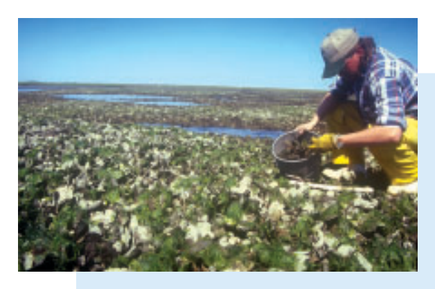
Oyster restoration efforts on the Chesapeake Bay's Eastern Shore.

Workgroup participants agreed that applied hatchery research is critical for developing oyster resources in the United States for private and public aquaculture — in assessing priority research goals, it is important to distinguish between developing viable oyster strains to serve the commercial aquaculture industry and developing sustainable strains to serve ecological restoration. For example, if oyster strains were bred for fast growth and disease tolerance so that they could be reliably brought to harvest in three years, that could well satisfy commercial growers;