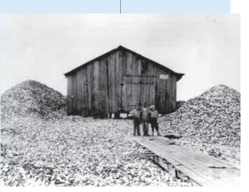
Oyster shucking house near Appalachicola, Florida, early 20th Century.

Ensure that the selective breeding program for producing the right oyster(s) for aquaculture and restoration employ