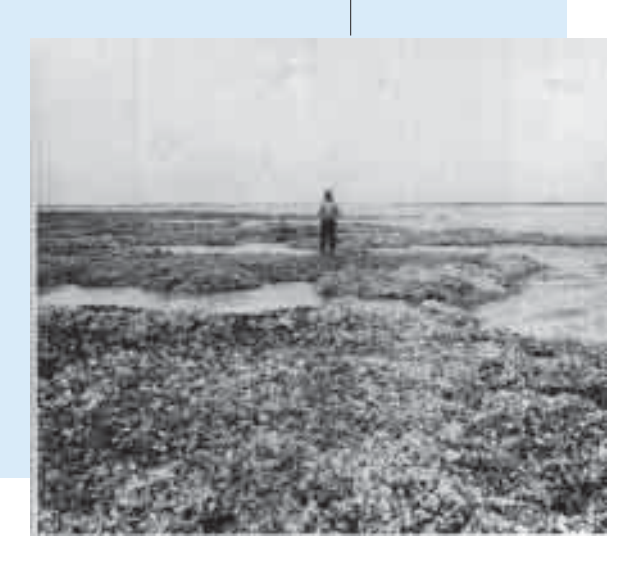
1925 oyster beds on flats in Georgia.

Intensify the current breeding program of disease-resistant oysters to expedite identification of regionally relevant oyster strain(s), while field testing the end products in large-scale resource restoration. Field testing should be scaled for rebuilding oyster resources under defined spatial and temporal conditions.