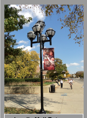
Ingalis Mall Entrance

The mission of the University of Michigan is to serve the people of Michigan and the world through preeminence in creating, communicating, preserving and applying knowledge, art, and academic values. and in developing leaders and citizens who will challenge the present and enrich the future.