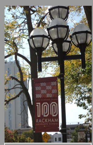
Rackham Centennial 100 Years and Counting

The mission of the University of Michigan is to serve the people of Michigan and the world through preeminence in creating, communicating, preserving and applying knowledge, art, and academic values. and in developing leaders and citizens who will challenge the present and enrich the future.