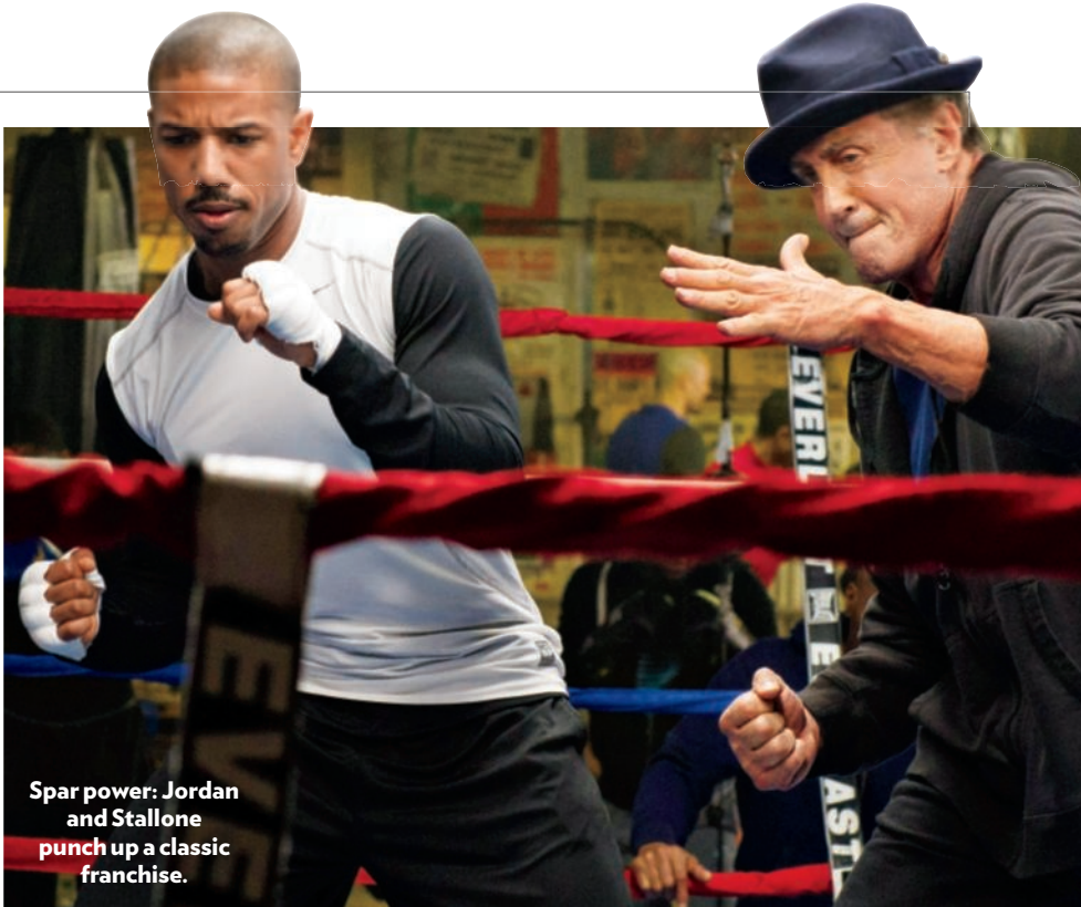
Spar power: Jordan and Stallone punch up a classic franchise.