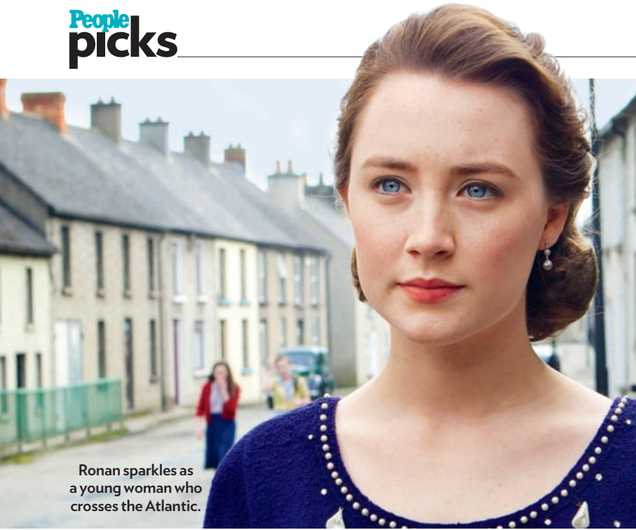
Ronan sparkles as a young woman who crosses the Atlantic.

No. 8 Brooklyn Saoirse Ronan takes us on a grand adventure DVD+STREAMING ROMANCE A former child actress, Oscar-nominated Ronan comes into her own as a grown-up star in Brooklyn . She's subtle yet ardent as a homesick Irish miss torn between two men (Emory Cohen and Domhnall Gleeson) and two lands in the early 1950s. A lively supporting cast adds spirit, but it's Ronan who delivers warmth. (March 15)