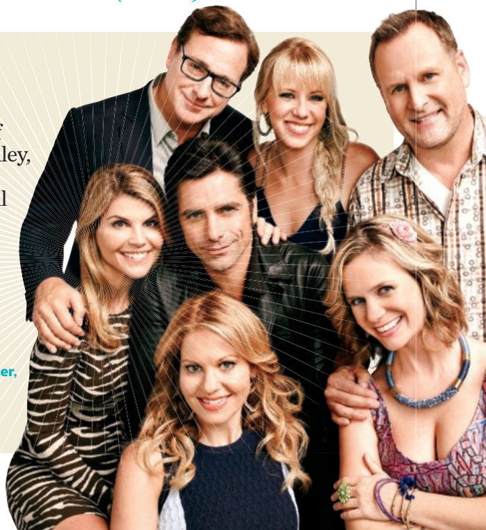
Under the same roof (clockwise from far left): Lori Loughlin, Bob Saget, Jodie Sweetin, Dave Coulier, Andrea Barber, Candace Cameron Bure and—of course—John Stamos.

It's a bit like a mastodon cloned from ancient DNA: huggable but dubious. Fans will be delighted. ( Launches Feb. 26 )