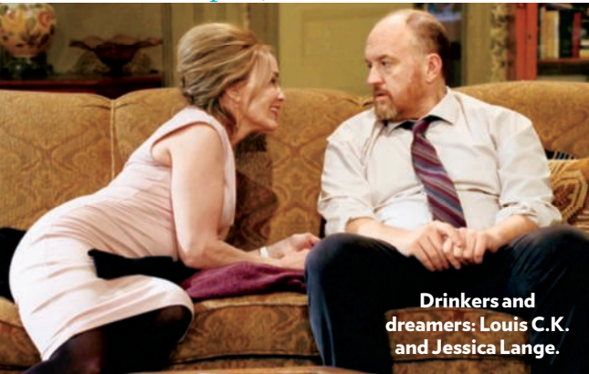
Drinkers and dreamers: Louis C.K. and Jessica Lange.

No. 8 Brooklyn Saoirse Ronan takes us on a grand adventure DVD+STREAMING ROMANCE A former child actress, Oscar-nominated Ronan comes into her own as a grown-up star in Brooklyn . She's subtle yet ardent as a homesick Irish miss torn between two men (Emory Cohen and Domhnall Gleeson) and two lands in the early 1950s. A lively supporting cast adds spirit, but it's Ronan who delivers warmth. (March 15)