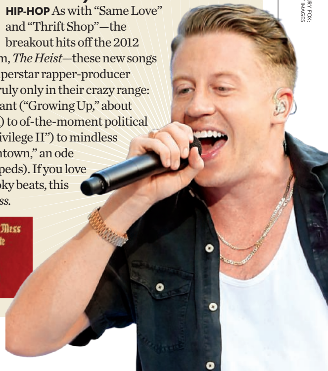
CLOCKWISE FROM TOP: LEFT: KERRY BROWN/TWENTIETH CENTURY FOX; MACKLEMORE/REXUS; FREDERICK M. BROWN/GETTY IMAGES