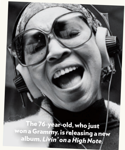
The 76-year-old, who just won a Grammy, is releasing a new album, Livin' on a High Note .

No. 9 Mavis! TV DOCUMENTARY Singing with her family and as a solo artist, Mavis Staples is both an astonishing musical force—encompassing gospel, protest songs, soul and funk—and apparently a woman who believes that all challenges can be met with joy. She makes you wonder how you can sit there, eating granola bars and watching her story, and not hop up, get out and emulate her spirit. (HBO, Feb. 29, 9 p.m.)