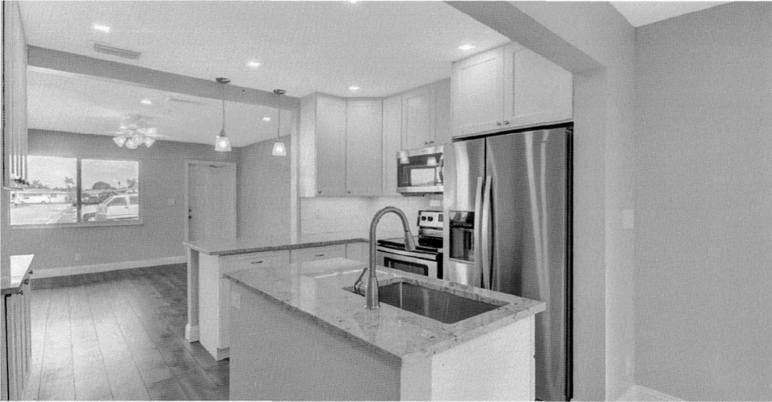
Making Small Areas Spacious