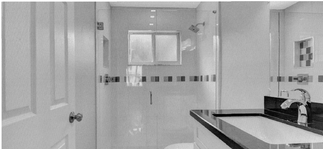
Luxurious Updated Bathrooms