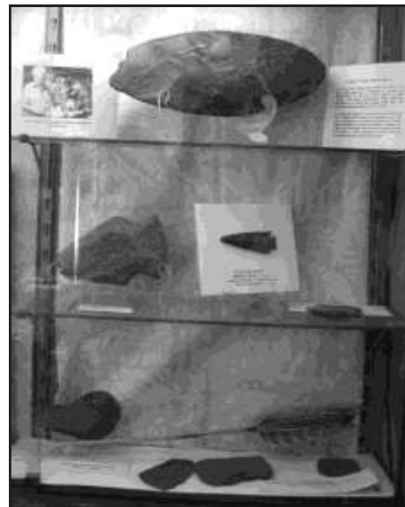
Wangunk/Native American items on display at Ruth Callander House Museum of Portland History

Nov 6 - Portland Exhibit - Museum open 2-4 pm