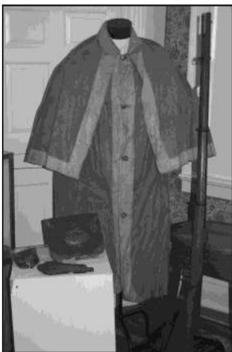
Items in Civil War display at the Ruth Callander House Museum of Portland History: (left) Civil War raincoat, rifle, bullet case, powder horn and belt case; (below) Civil War surgeon's field kit.