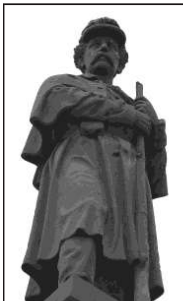
The soldier atop Portland's Civil War Monument.