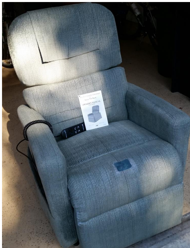
Lift Recliner: Purchased at Relax-a-back, Lays flat, located in Burnsville