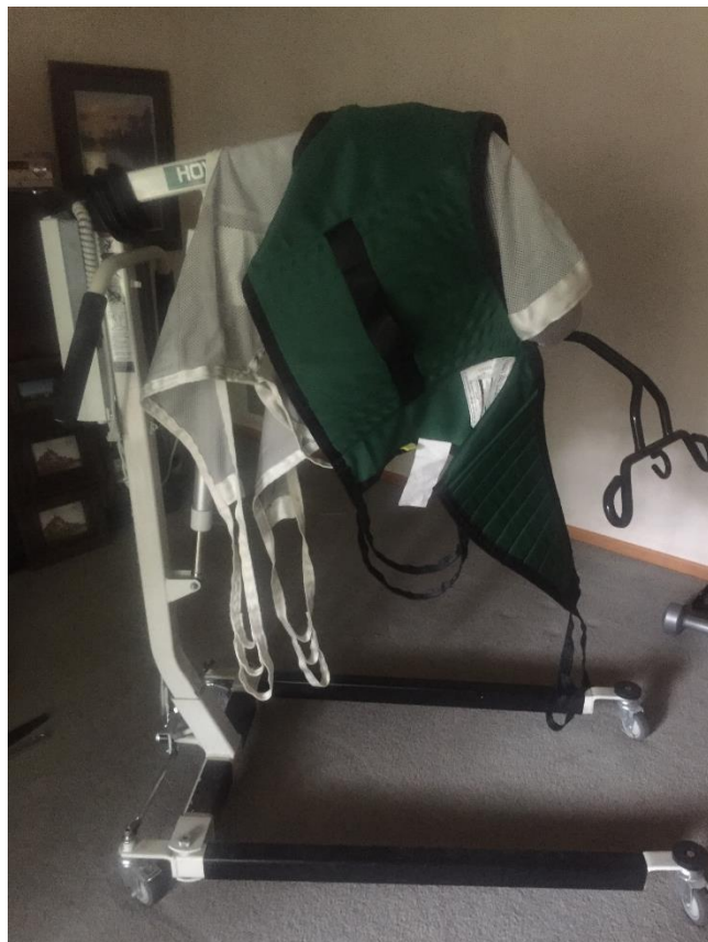
Hoyer Lift: Invacare brand, electric, Woodbury