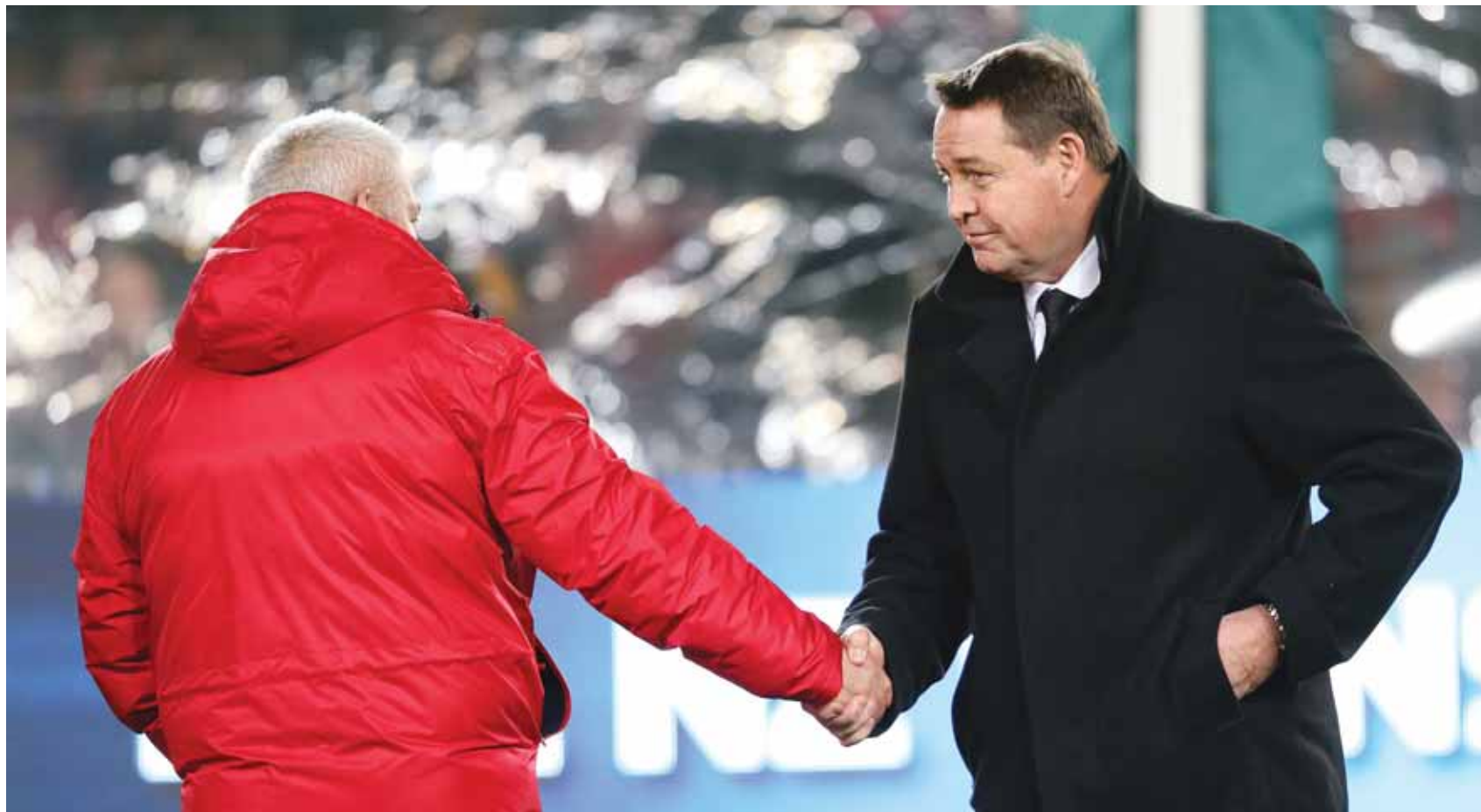
Lions coach Warren Gatland (L) and New Zealand All Blacks coach Steve Hansen (R) shake hands at Eden Park in Auckland on Saturday.

'When they can score tries like that first one you're sitting there thinking they should be doing that more often'