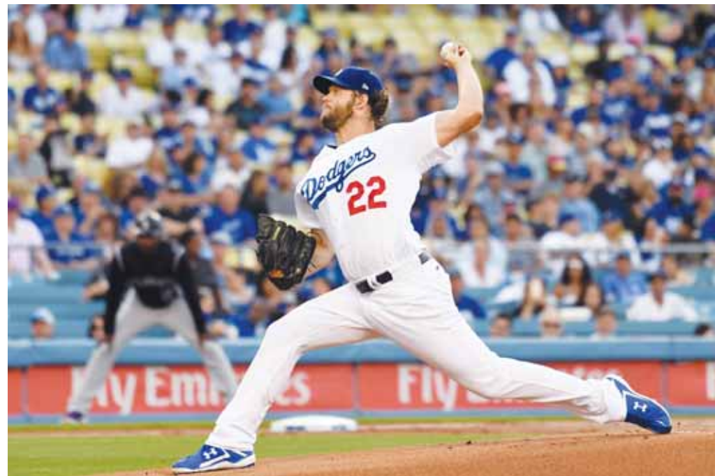
Los Angeles Dodgers starting pitcher Clayton Kershaw pitches against the Colorado Rockies in the first inning at Dodger Stadium.