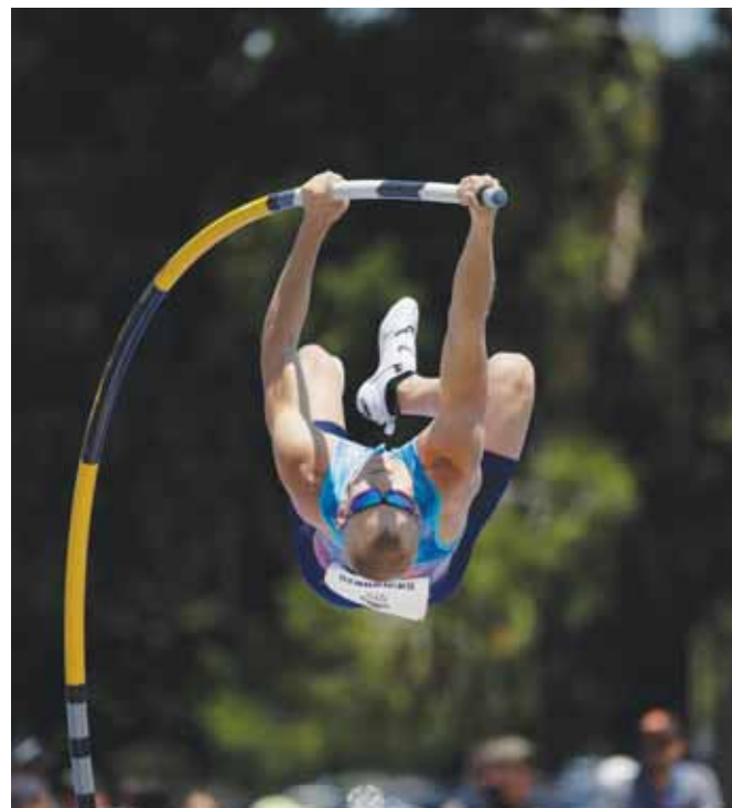
Sam Kendricks leaps to victory in the men's pole vault final of the 2017 USA Track & Field Championships at Hornet Stadium in Sacramento, California.

In the men's 1,500m final, 2016 Olympic champion Matthew Centrowitz was upset after being pipped for victory by the fast-finishing Robby Andrews . Andrews won in 3:43.29 with Centrowitz second in 3:43.41.