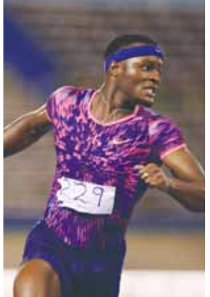
Omar McLeod sets a new Jamaican national record in the men's 110m hurdles final during the Jamaica National Track & Field trials in Kingston Jamaica on Saturday.