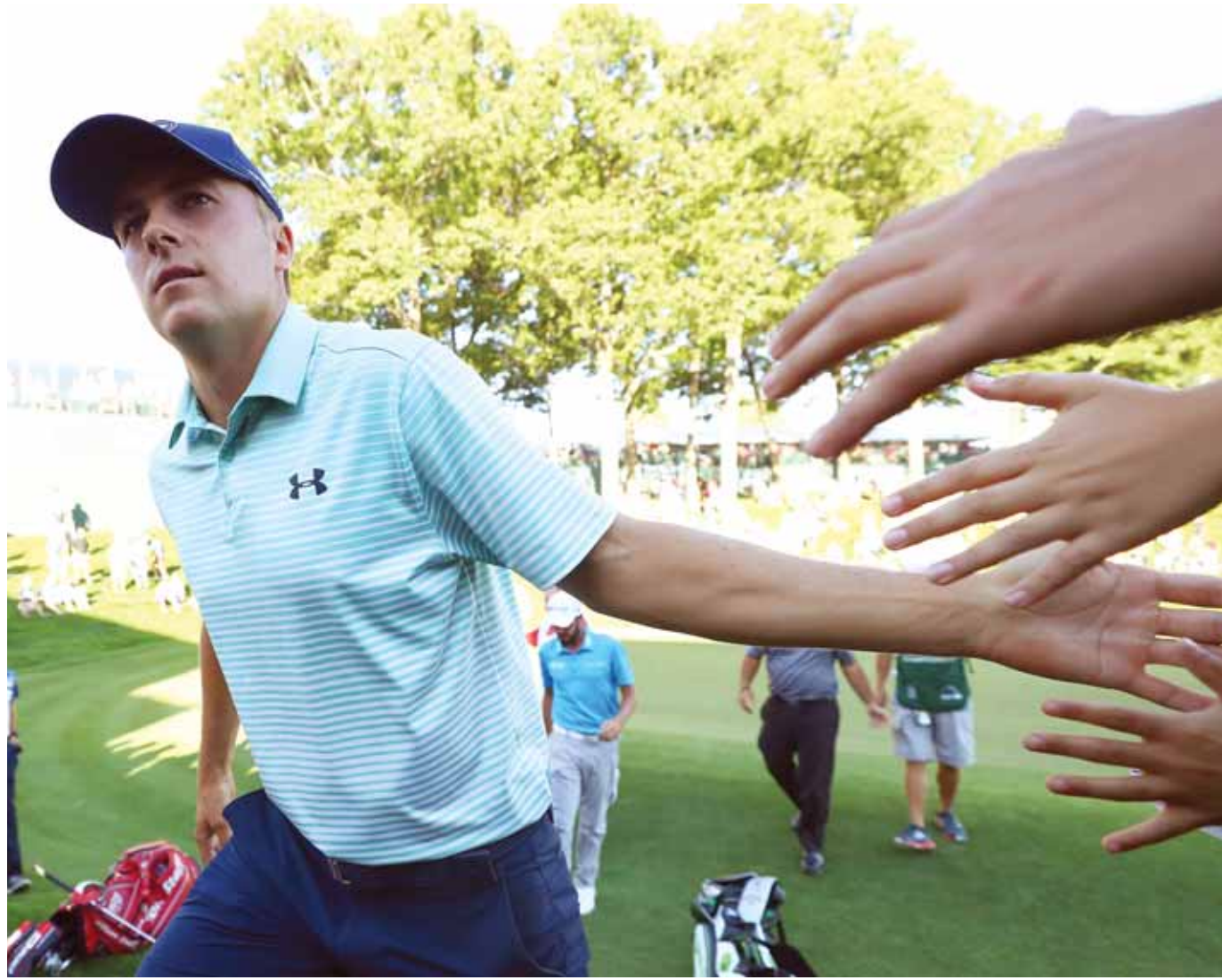
Jordan Spieth of the United States high fives fans after putting on the 18th green during the third round of the Travelers Championship at TPC River Highlands in Cromwell, Connecticut.

Spieth followed with birdies at the par-5 sixth and par-4 seventh. He blasted from a bunker to off the edge of the green then sank the birdie bid from 27 feet, then landed his approach inside three feet and sank the