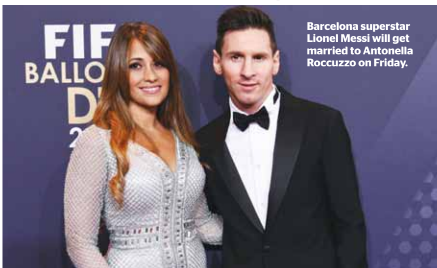
Barcelona superstar Lionel Messi will get married to Antonella Rocuzzo on Friday.

In the Las Flores neighbourhood, just behind the City Center complex, Los Monos holds virtually total power, according to Del