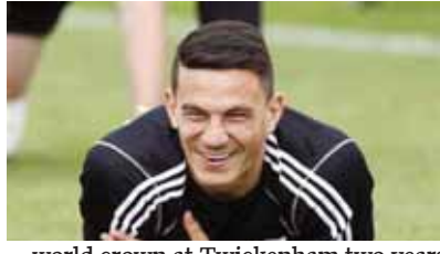
world crown at Twickenham two years ago.

The latest touching moment follows Williams memorably giving away his World Cup winners' medal to a young English fan after the All Blacks won the