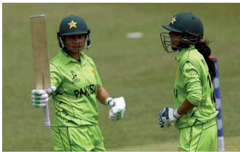
Pakistan's Bibi Nahida raises her bat after reaching 50 runs during the Women's World Cup match against South Africa in Leicester yesterday.

think it was a great effort by the girls, the way they fought it out. We lacked in all three departments though.