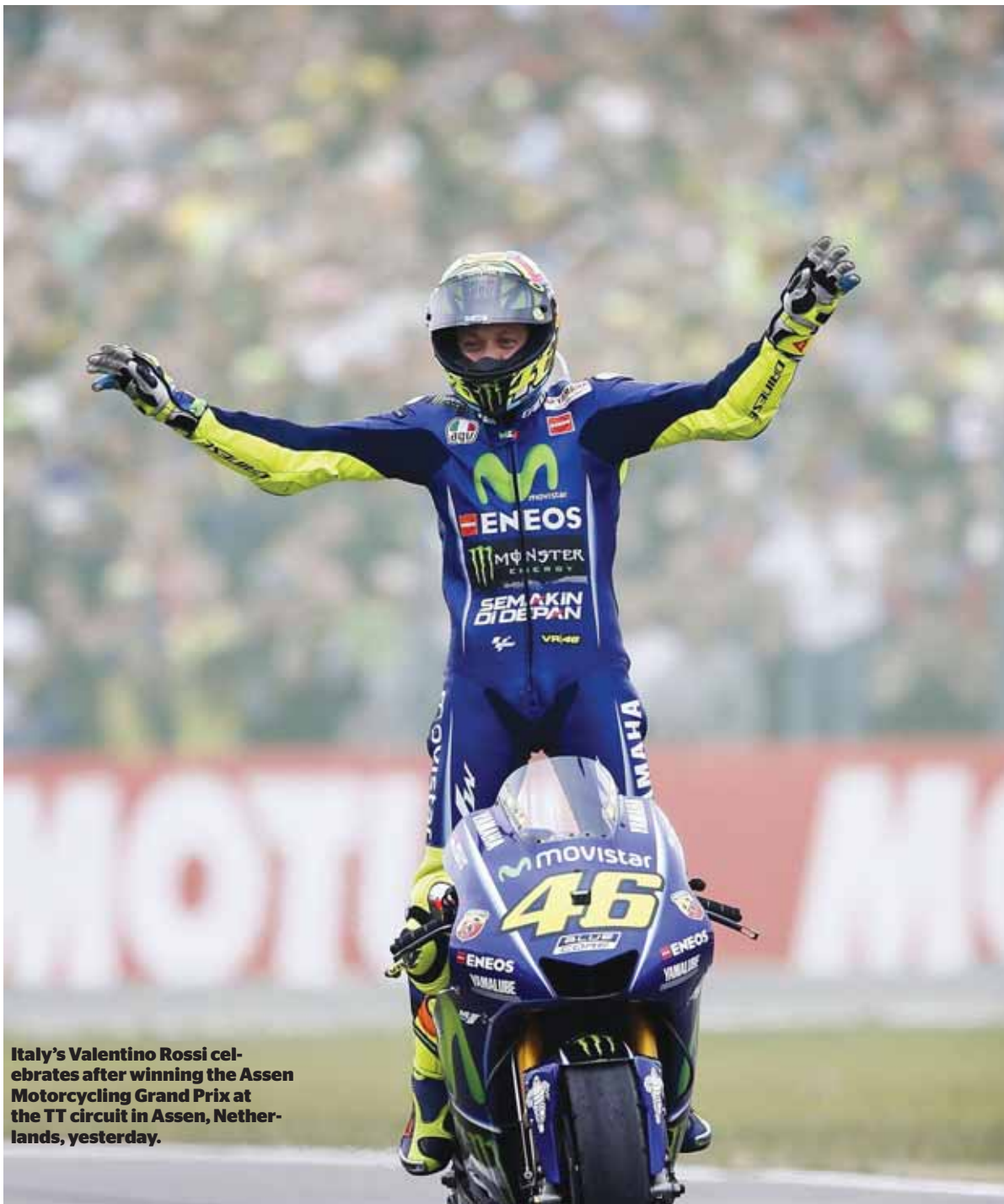
Italy's Valentino Rossi celebrates after winning the Assen Motorcycling Grand Prix at the TT circuit in Assen, Netherlands, yesterday.

'I race with motorcycles for this feeling: for what I feel in the five or six final laps of the race. That's always great'