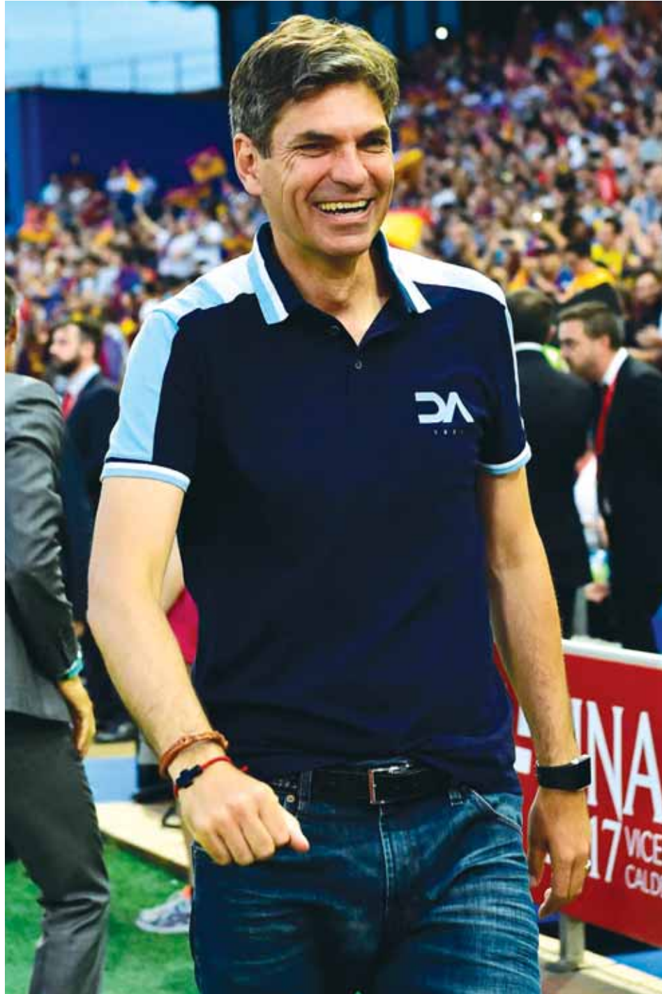
Southampton's new manager Mauricio Pellegrino has signed a three-year contract.

He has said he learned organisation from Marcelo Bielsa, space from Van Gaal. With Benítez, he saw the obsession with tactics, and England from the inside, how it is played and lived, what it means culturally. The feel for the game and for his players, though, is his own – and there's a moral element to it. "People have less religious belief and less belief in politicians: the only thing we have left to identify with is the shirt," he has said. "That's for life: grandad, dad,