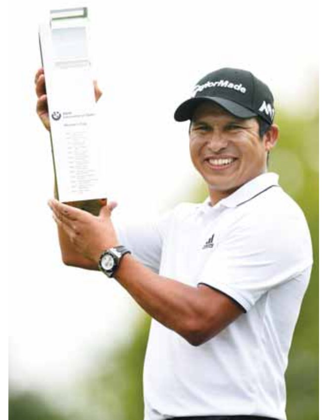
Andres Romero of Argentina smiles as he holds the trophy after winning the final of the BMW International Open golf tournament in Eichenried near Munich yesterday.