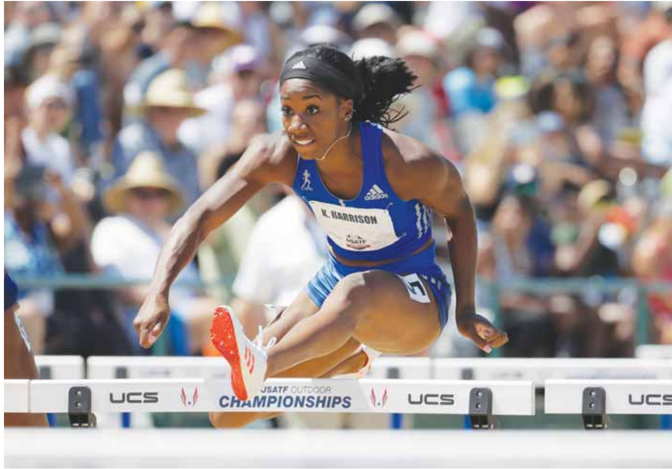
Kendra Harrison clears a hurdle on the way to victory in the women's 100m hurdle final of the 2017 USA Track & Field Championships at Hornet Stadium in Sacramento, California, on Saturday.

The 22-year-old Texas runner now owns the five fastest