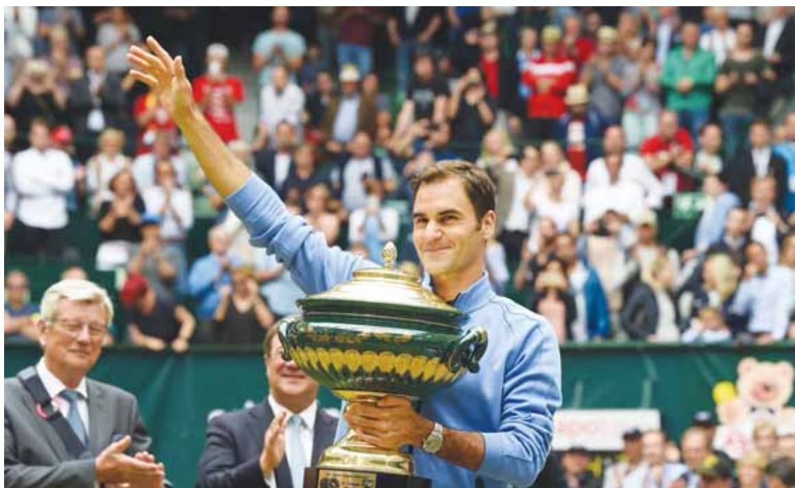
Roger Federer poses with his trophy after winning his final against Alexander Zverev in Halle, Germany, yesterday.

And he confidently served it out to wrap up the 92nd ATP Tour title of his career, which moves him to within two of second-placed Ivan Lendl on the all-time list.