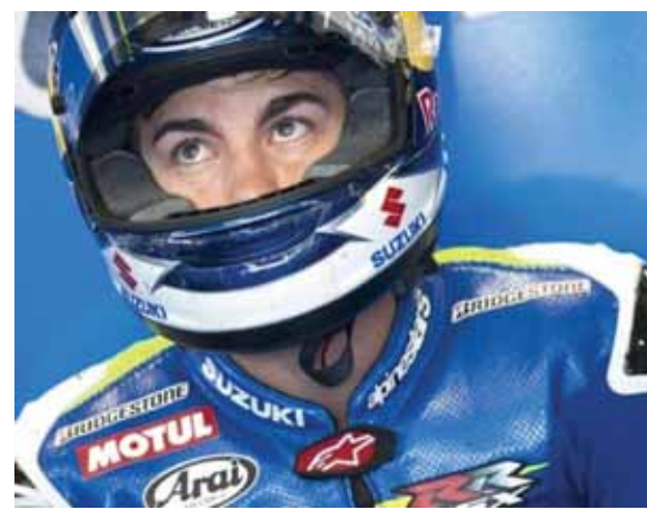
Crashed out: Maverick Vinales

"Everything is open and this year we discovered that, from one track to the other, the situation can change a lot. We have to wait for next week and try to be competitive also at the Sachsenring."