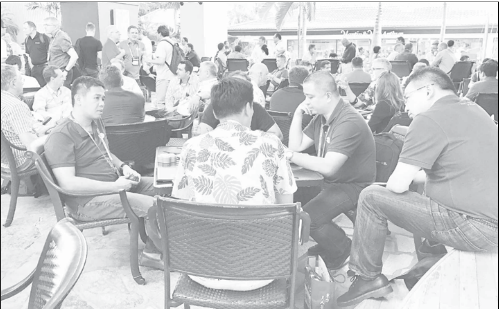
Thousands of Pacific Telecommunications Conference attendees gather this week for workshops, meetings, negotiations and libations (above at the Tapa Bar) at the Hilton Hawaiian Village, Waikiki, Hawaii. Representatives from both Samoas, and neighboring Pacific Islands and associated cable/satellite entities are participating in the event.