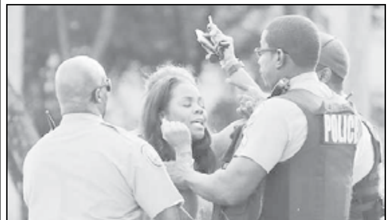
A concerned mother is meet by Miami-Dade police officers as she searches for her child after several were injured in a shooting at Martin Luther King Jr. Memorial Park in Miami-Dade, Fla., Monday, Jan. 16, 2017. The Miami Herald reports that hundreds of people had gathered in the park after the annual MLK Day parade.