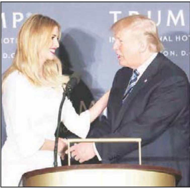
FILE - A Wednesday, Oct. 26, 2016 file photo showing US President elect Donald Trump greeting his daughter Ivanka Trump during the grand opening of Trump International Hotel in Washington. Trump wanted to praise his daughter on Twitter — instead he accidentally sent his message to another Ivanka. The message was directed to a woman named Ivanka Majic in Brighton, southern England.