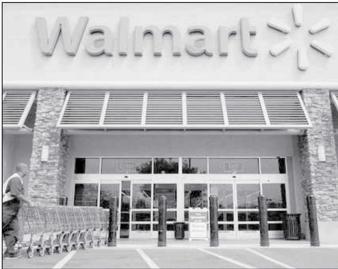
FILE - In this May 9, 2013, file photo, a worker pushes shopping carts in front of a Wal-Mart store in La Habra, Calif. Wal-Mart plans to add about 10,000 retail jobs in the U.S. as it opens new stores and expands existing locations. The world's biggest retailer said Tuesday, Jan. 17, 2017, that there will also be about 24,000 construction jobs as well.