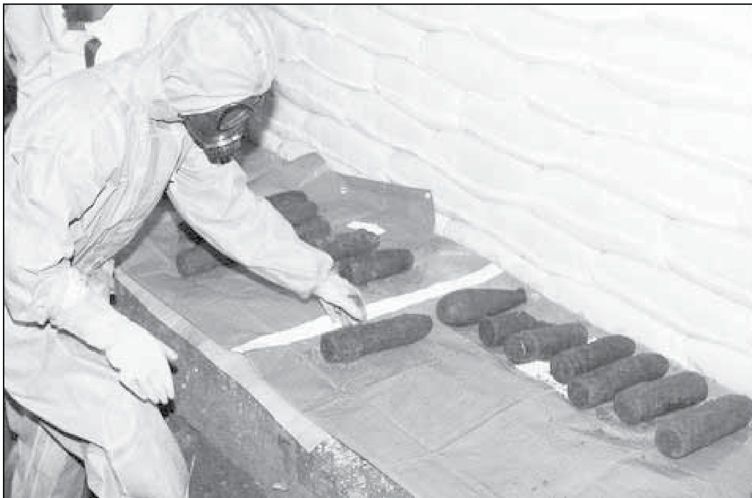
FILE - In this Wednesday, July 5, 2006, file photo, a Chinese chemical weapons expert aligns poison gas bombs dug from a pit in Ning'an, northeastern China's Heilongjiang province. China's military said Tuesday that more than 2,500 abandoned Japanese wartime chemical weapons collected from northern China, including Beijing and the port city of Tianjin, have been destroyed in a four-year disposal process.