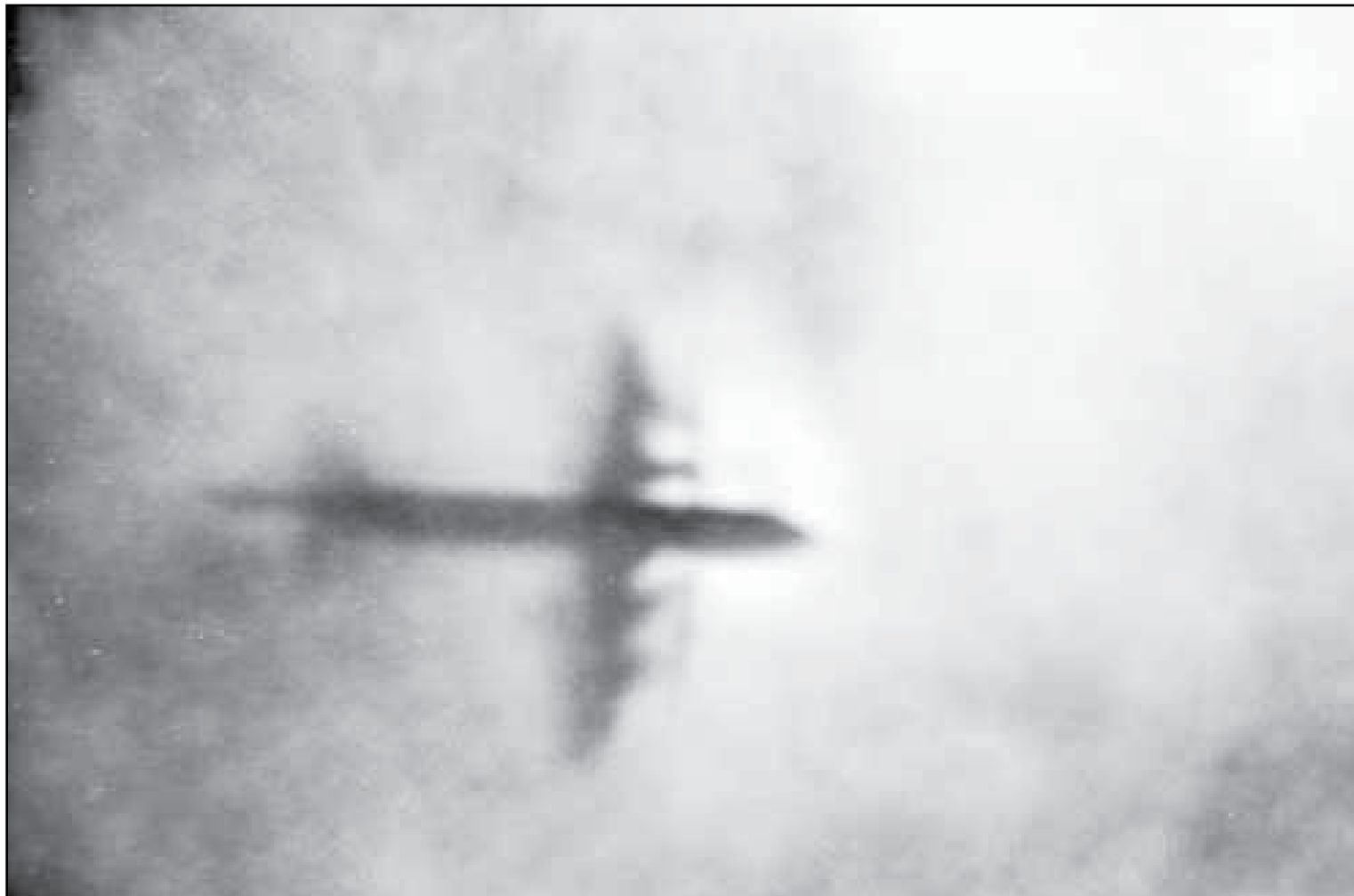
FILE - In this March 31, 2014 file photo, the shadow of a Royal New Zealand Air Force P3 Orion is seen on low level cloud while the aircraft searches for missing Malaysia Airlines Flight MH370 in the southern Indian Ocean, near the coast of Western Australia. After nearly three years, the hunt for Malaysia Airlines Flight 370 ended in futility and frustration on Tuesday, Jan. 17, 2017, as crews completed their deep-sea search of a desolate stretch of the Indian Ocean without finding a single trace of the plane.