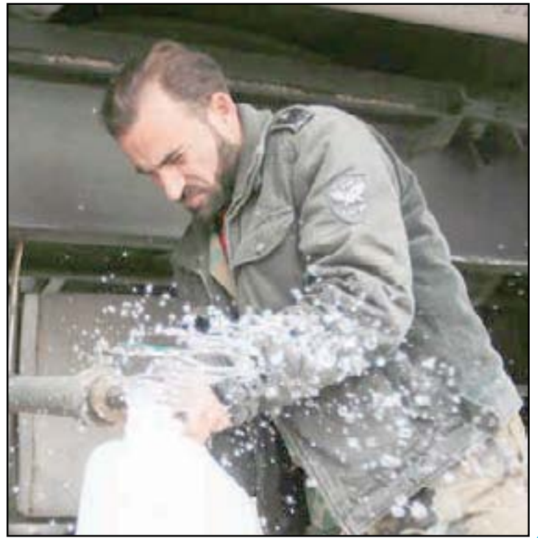
In this Monday, Jan. 16, 2017 photo, man fills a plastic container with water from a tap water in Damascus, Syria. Water cut-offs have been almost continuous since Dec. 22, in the worst water crisis known to Damascus residents. It comes at a time when the country is suffering electricity cuts and lack of other services as Syria's conflict approaches its seventh year in March.