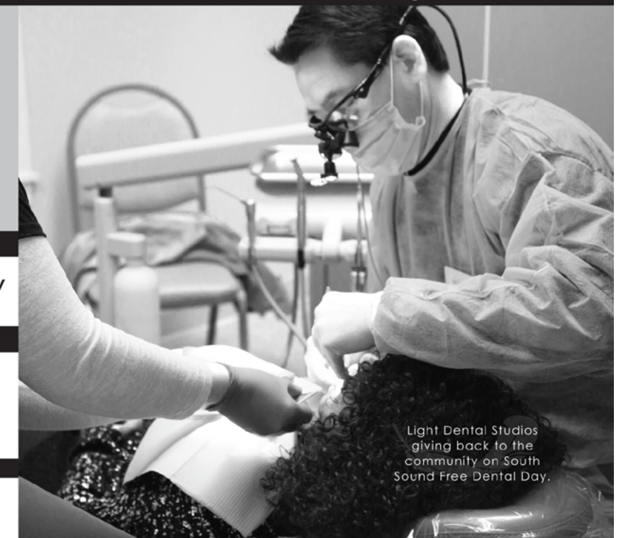
Light Dental Studios giving back to the community on South Sound Free Dental Day.

discover us at lightdentalstudios.com please send your resume with personal & professional references to dr.angie.dunn@adunnds@lightdentalstudios.com