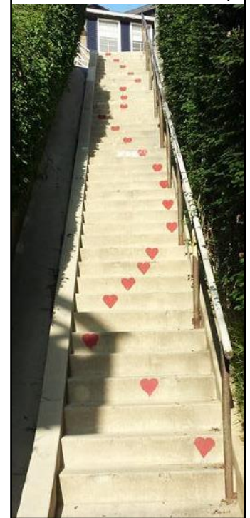
Panorama/Lanternman Stairs - 51 steps

Anyone wanting to skip the Hoover Walk stairway and Ricardo's mural, can continue west on Hyperion, which after crossing Landa, becomes Fountain, and take it to the corner of Manzanita. From here, turn left to head south on Manzanita. Travel up the stairway to Sunset, turn left again taking Sunset back to Sunset Triangle Plaza, for a 5.5 mile total trip.