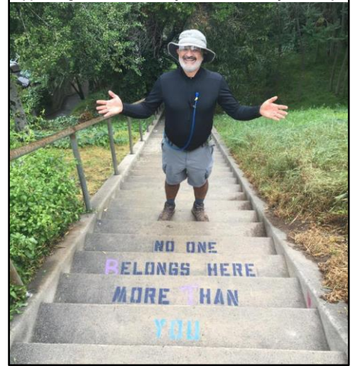
Upper Flight, Meadow Valley Terrace Stairway - 93 steps