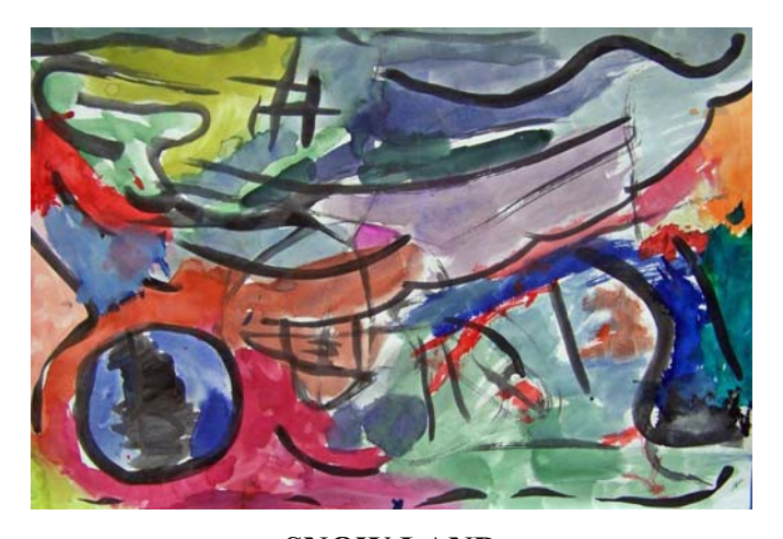
SNOW LAND By Christina W.

A butterfly lands on a pink flower It is the only flower in snow land You can still see the snowy mist in the distance You can still see the little butterfly resting on the flower