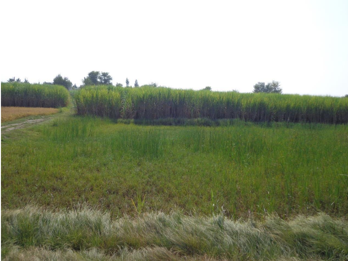
Figure-4: Sugarcane Fields – major Crop of the Project Area