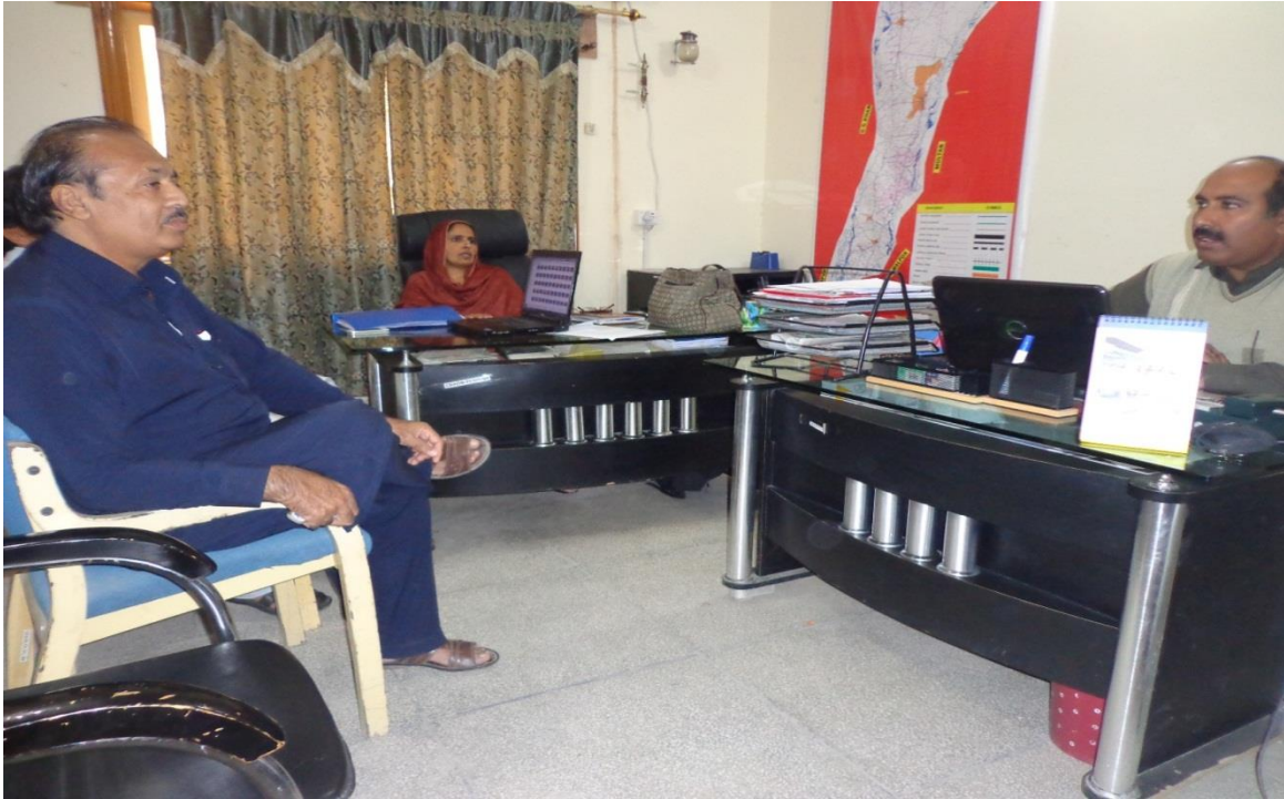
Figure-2: Meeting in the Office of SYCOPE NGO Muzaffargarh