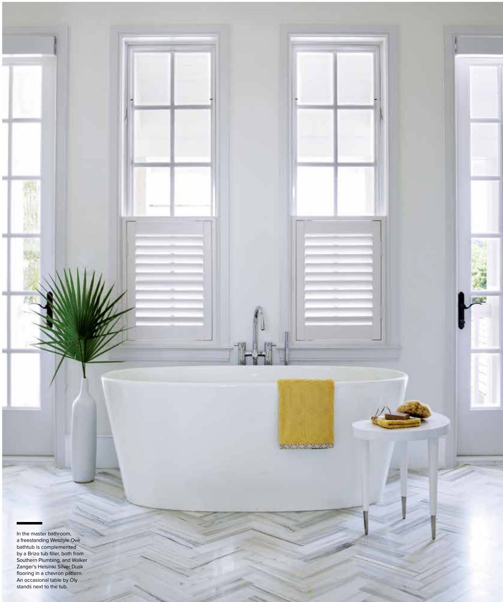
In the master bathroom, a freestanding Wetstyle Ove bathtub is complemented by a Brizo tub filler, both from Southern Plumbing, and Walker Zanger's Helsinki Silver Dusk flooring in a chevron pattern. An occasional table by Oly stands next to the tub.