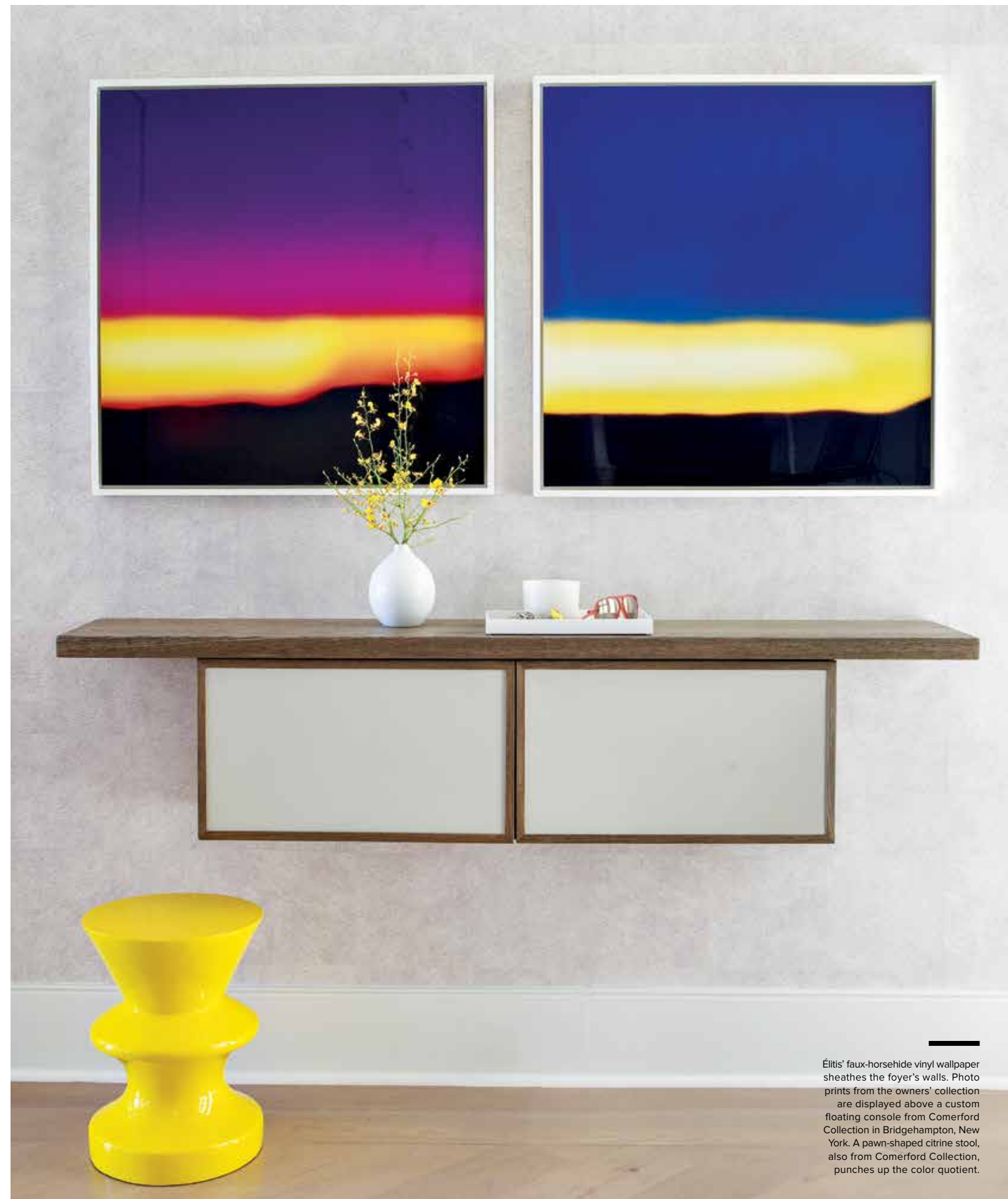
Élitis’ faux-horsehide vinyl wallpaper sheathes the foyer’s walls. Photo prints from the owners’ collection are displayed above a custom floating console from Comerford Collection in Bridgehampton, New York. A pawn-shaped citrine stool, also from Comerford Collection, punches up the color quotient.

Today, the property sustains the family’s vacation lifestyle of kicking back, swimming, enjoying the beach and entertaining. “We love this home so much,” confides the wife. “It is where we are happiest and most relaxed. If we’re on holiday, we’re here.” ■