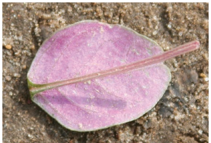
Figure 9. Note the petiole of this Palmer amaranth seedling is longer than the leaf blade when bend back over the blade.