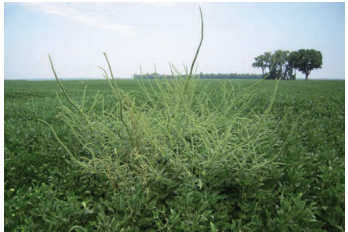
Figure 10. A Palmer amaranth plant growing in soybean with multiple terminal seed heads.

The presence of stiff, pointy bracts on the female seed head and leaf axils can lead to confusing Palmer amaranth with spiny amaranth or spiny pigweed ( Amaranthus spinosus ). Spiny amaranth is predominantly a weed of pastures, livestock holding pens, and feeding areas; it is rare in agronomic fields. Spiny amaranth has a bushy growth pattern and exhibits the spiny bracts throughout its life cycle, whereas Palmer amaranth exhibits the bracts only at maturity and during reproductive stages.