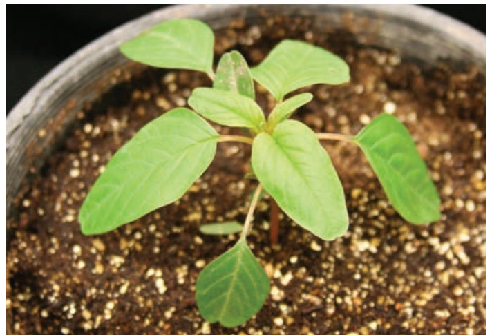
Figure 7. Young Palmer amaranth seedlings exhibit an extended petiole on the first true leaves.