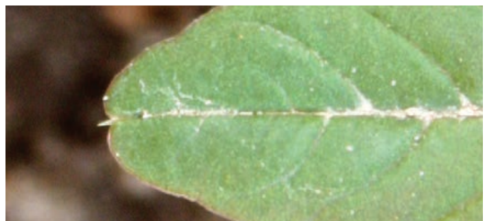
Figure 13. Some Palmer amaranth plants have a single hair in the leaf tip notch.