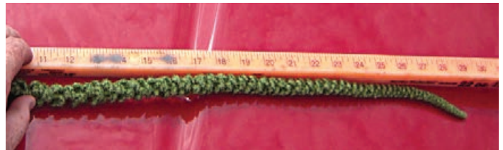
Figure 11. A Palmer amaranth seed head measuring close to 30 inches long.