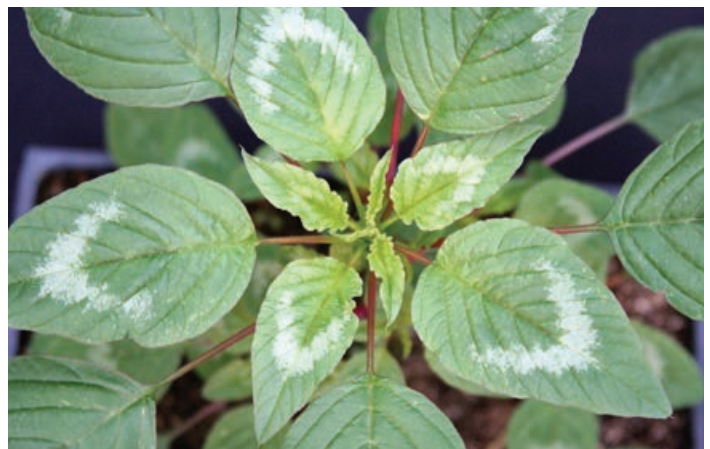
Figure 12. Some Palmer amaranth leaves have white chevron or V-shaped watermarks.