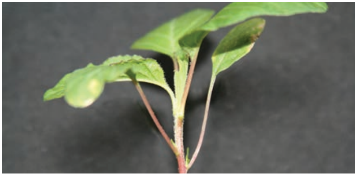
Figure 1. Redroot and smooth pigweeds have hairs on their stems and leaf surfaces. These hairs distinguish them from common waterhemp and Palmer amaranth.

Only redroot and smooth pigweeds have hairs (pubescence) on their stems and leaf surfaces (Figure 1). The fine hairs will be most noticeable on the stems towards the newest growth. Palmer amaranth and common waterhemp do not have hair on any surface. Looking for pubescence is a quick and easy way to differentiate redroot and smooth pigweeds from the other two amaranths.