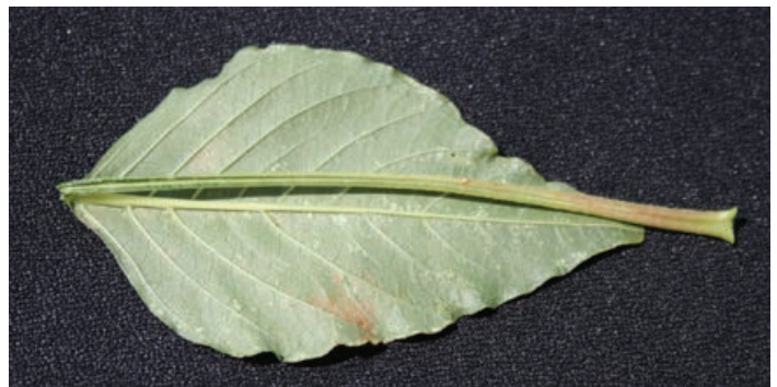
Figure 3. A Palmer amaranth petiole bent back over the leaf blade, demonstrating the length of its petiole.