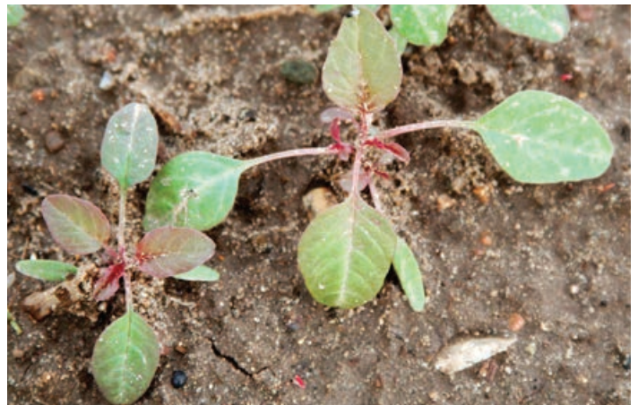
Figure 8. A Palmer amaranth seedling. Note the extended petiole on the first true leaves.