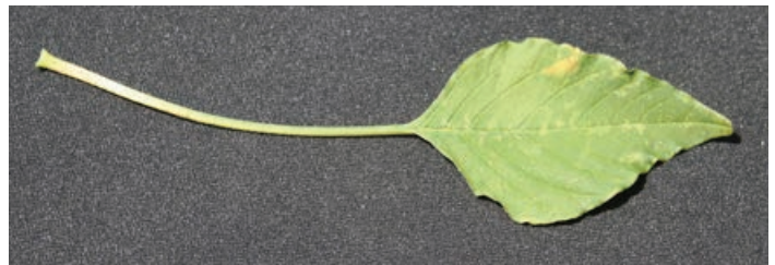
Figure 2. A Palmer amaranth leaf blade with extended petiole.

This is the most consistent and reliable characteristic that differentiates Palmer amaranth from common waterhemp, and it is most evident on the oldest leaves of plant (lowest on the stem). Leaf shape, leaf watermark, and leaf tip hair characteristics will help confirm the identity of Palmer amaranth; however, these characteristics are much more variable within species and can make correct identification difficult and frustrating if used alone.