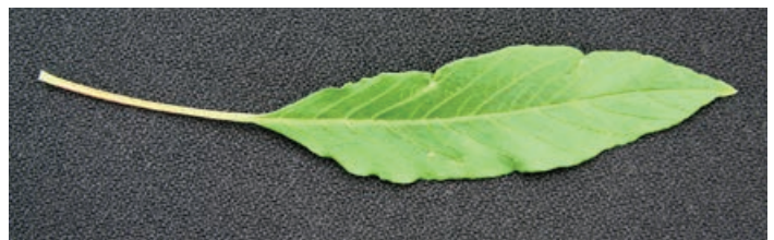
Figure 4. The linear, lance-shaped leaf blade and short petiole characteristic of common waterhemp.