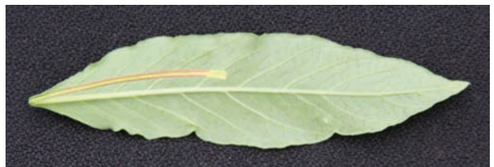
Figure 5. A common waterhemp petiole bent back over the leaf blade, illustrating the length of its petiole.