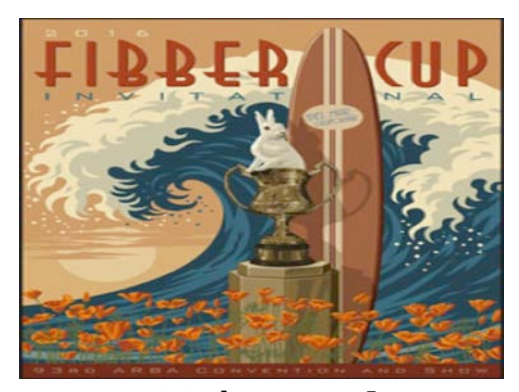
93rd Annual ARBA Convention