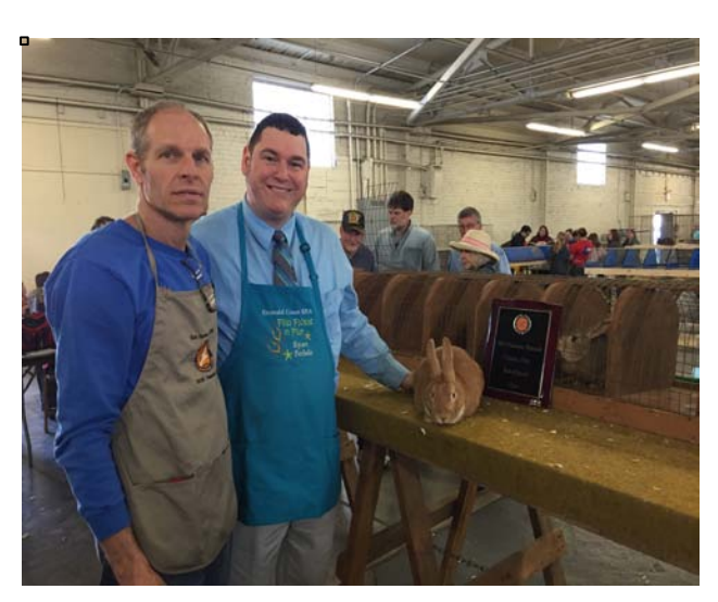
PAL NATIONALS BEST OF BREED