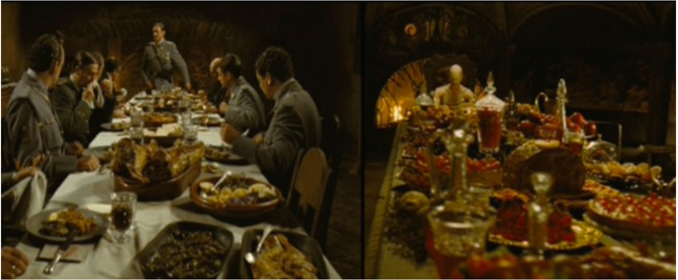
A monster sits at the head of a banquet table twice in Pan's Labyrinth .