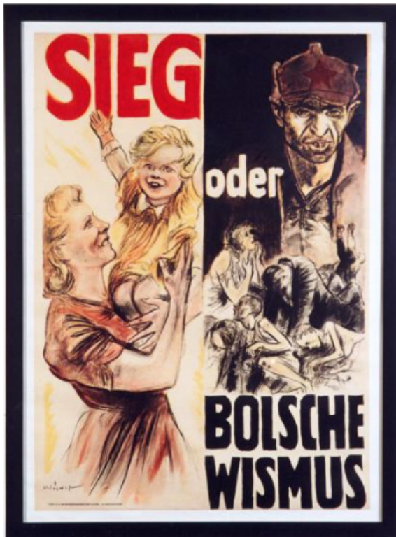
"Victory or Bolshevism": A German propaganda poster shows the terrible consequences of losing the war, contrasted with their idyllic image of life under the Third Reich.