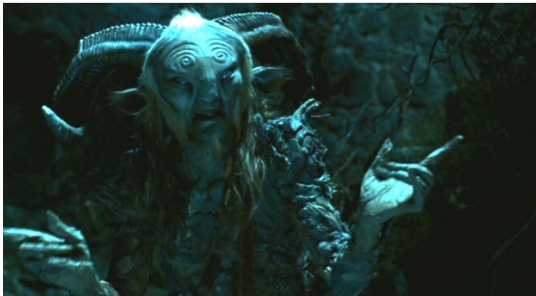
When Ofelia explores the labyrinth one night, she meets the Faun, who tells her of her true identity as Princess Moanna.