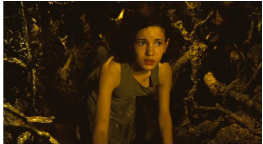
Ofelia must crawl under the roots of a poisoned magical tree in order to complete her first task.