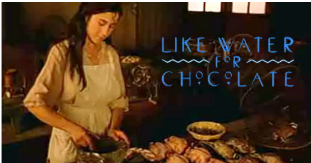
Like Water for Chocolate , a 1989 novel by Laura Esquivel, centers on the culinary, romantic, and sometimes magical experiences of the heroine, Tita.

Analyze a particular point of view or cultural experience reflected in a work of literature from outside the United States, drawing on a wide reading of world literature.