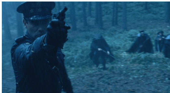
In the "real" world, Captain Vidal's soldiers engage in a shoot-off in the rain against the rebel soldiers.