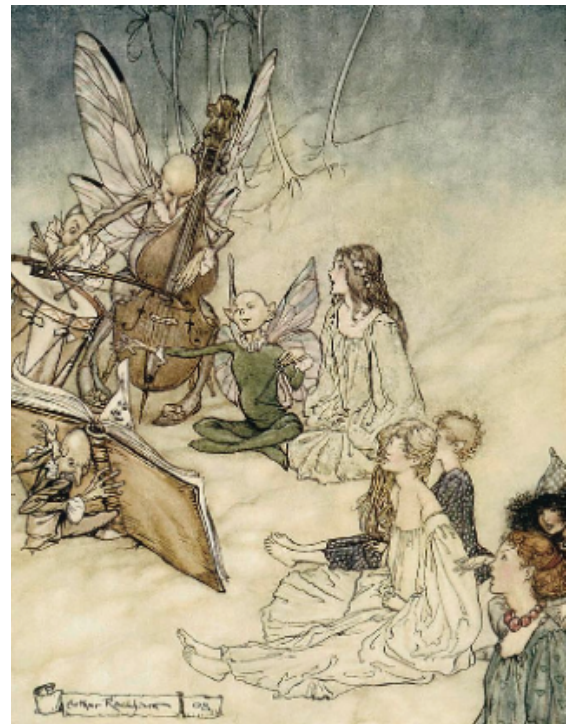
"And a Fairy Song" by Arthur Rackham.