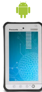
7" TOUGHPAD JT-B1