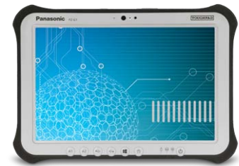
10.1" TOUGHPAD FZ-G1