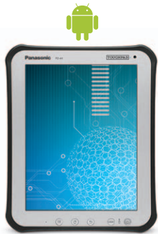
10.1" TOUGHPAD FZ-A1

With more than 24 years of experience designing, testing and building the most reliable professional tablet solutions, Panasonic is unrivaled in offering the best mobile tablet solutions on the market. For combining data and device security, seamless connectivity, enterprise-level technology and worry-free operation, count on Panasonic Toughpad tablets to get the job done.