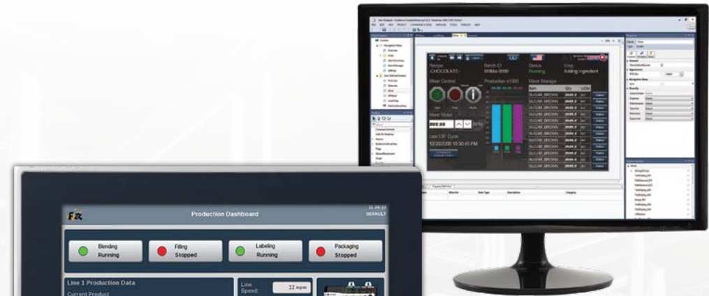
Studio 5000 View Designer Software