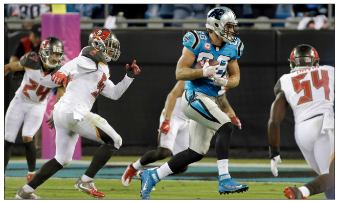
Tight end Greg Olsen totaled a career-high 181 receiving yards in Week Five vs. Tampa Bay