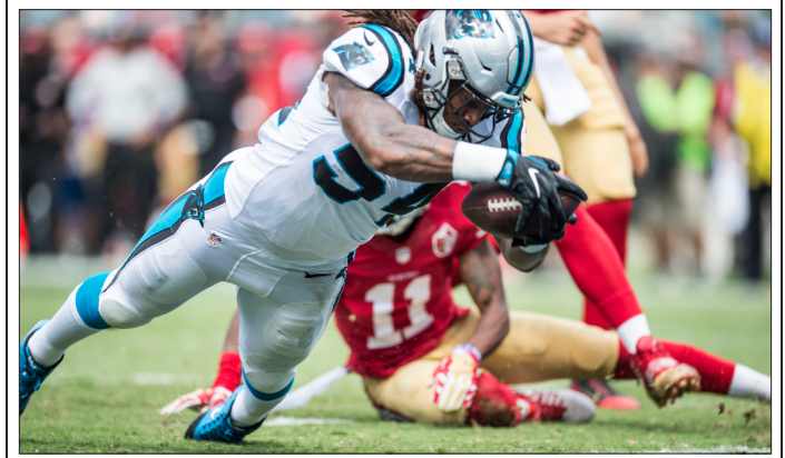
Linebacker Shaq Thompson dives into the end zone in Week Two vs. San Francisco (9/18/16) for six of the Panthers 95 takeaway points in 2016.