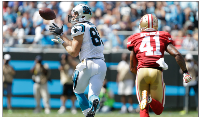
Tight end Greg Olsen was one of two 100-yard receivers for the Panthers against San Francisco (9/18/16).

Olsen and Benjamin were the first pair of 100-yard receivers since the duo accomplished the feat in 2014 vs. Tampa Bay (12/14/14).