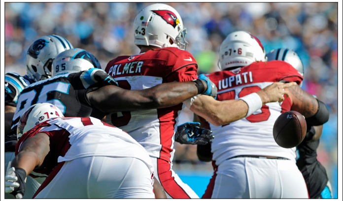
Defensive end Charles Johnson forces a fumble by quarterback Carson Palmer in Week Eight vs. Arizona (10/30/16).