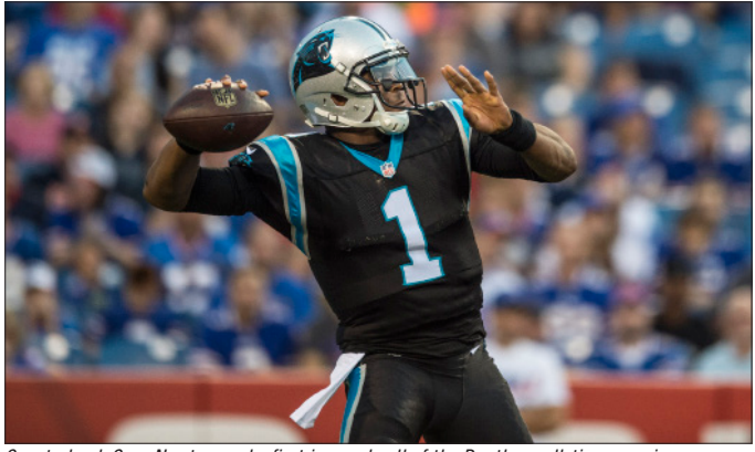
Quarterback Cam Newton ranks first in nearly all of the Panthers all-time passing statistics.