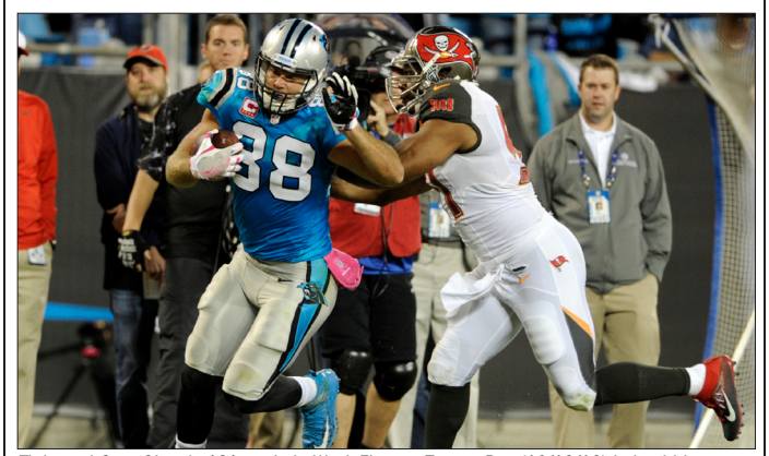
Tight end Greg Olsen's 181 yards in Week Five vs. Tampa Bay (10/10/16) helped him pass Kellen Winslow (1979-87) for eight all-time in receiving yards among NFL tight ends.

Olsen is tied for 11th among NFL tight ends with 52 career touchdown receptions. Olsen needs one more touchdown catch to tie Dallas Clark (53 from 2003-13) for 10th all-time.