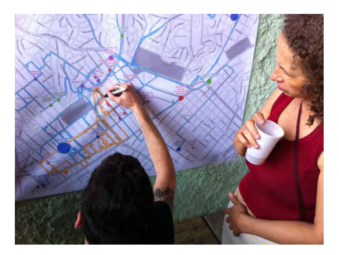
Researchers and cooperative members fill in details on the map of a manual picker's walking route. A public workshop at the end of the experiment allowed the whole cooperative and members of the community to respond to and augment the collected geographic data.

In the first part, each waste collector carried a small GPS logger on his or her daily route. At the end of the day, we conducted interviews with the collectors in which they used a laptop to see their collection paths traced on a map. We