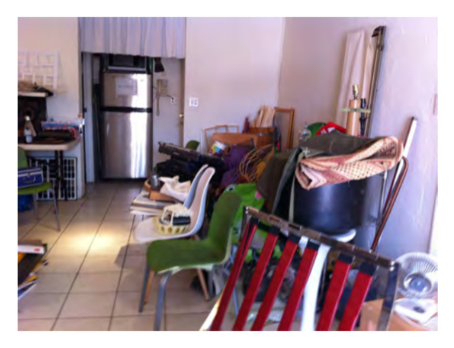
Materials recovered from the dump.

The Artist in Residence Program at Recology San Francisco offers six artists per year the opportunity to make trash into treasure. Recology is a resource recovery company in San Francisco that collects all household recyclables, composta-