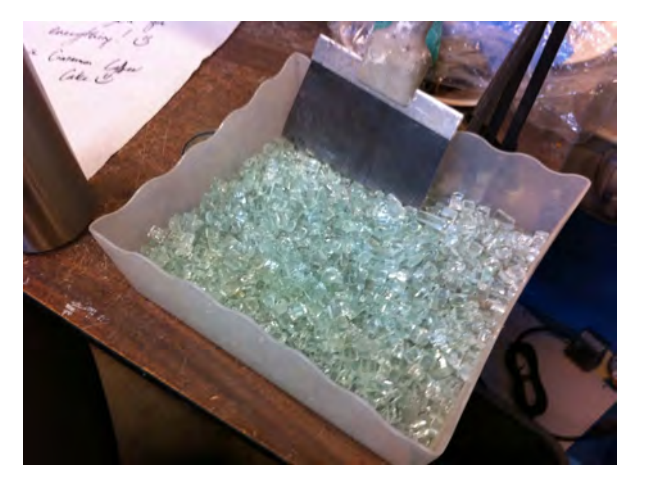
Broken glass from Muni bus shelter.

Following the work of one artist in residence, Reddy Lieb, the program has continued to make beautiful glass bowls.