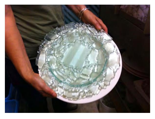
Glass plate made from the Muni broken glass.