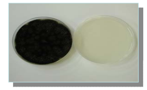
Aspergillus niger ATCC 16404 : METHYL+PROPYL PARABEN (2:1) 0.05%