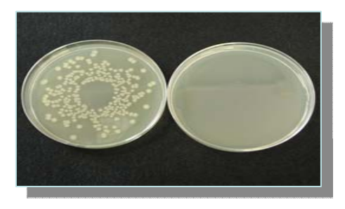
Escherichia coli IFO 3972 : METHYL+PROPYL PARABEN (2:1) 0.1%