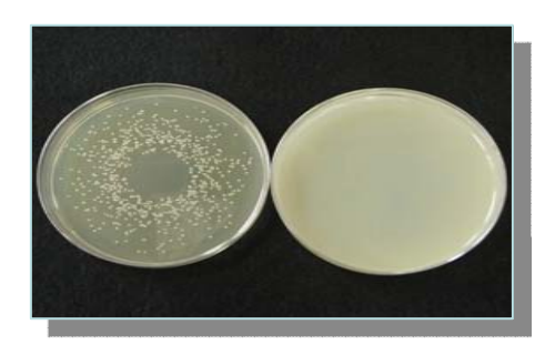
Pseudomonas aeruginosa IFO 13275 : METHYL+PROPYL PARABEN (2:1) 0.2%