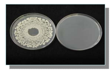
Candida albicans ATCC 10231 : METHYL + PROPYL PARABEN (2:1) 0.05%