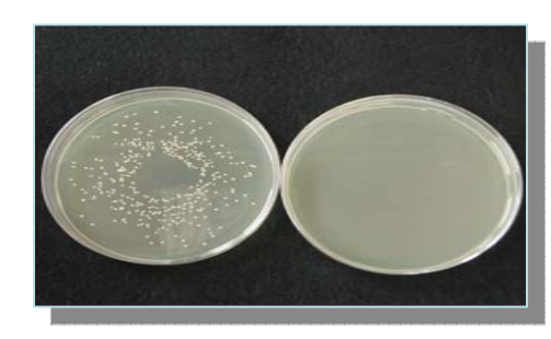
Staphylococcus aureus IFO 13276 : METHYL+PROPYL PARABEN (2:1) 0.1%