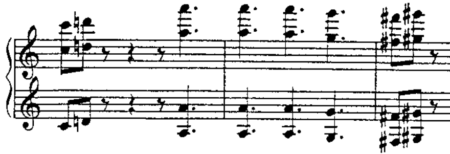
Example 5. Bartok Sonata for Two Pianos and Percussion, first movement, measures 426-428, piano I part.