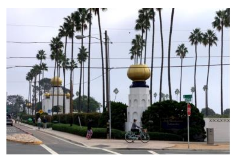
Photo 1: Golden Lotus Flowers top the towers along Highway 101, symbolic of a person's journey into self-realization ("Christ consciousness").