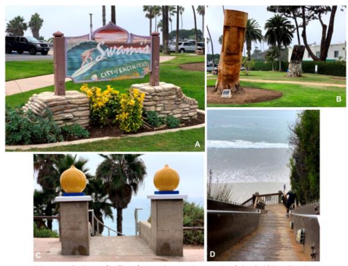
Photoset 2: Swami's Beach (A), just to the south of the Self-Realization Fellowship in Encinitas. Buildings for retreat-goers and resident hermits can be seen beyond the Easter Island Heads (B). A walk through the Lotus Flower stairway (C) leads to the beach below, a favorite surf spot (D) in San Diego.