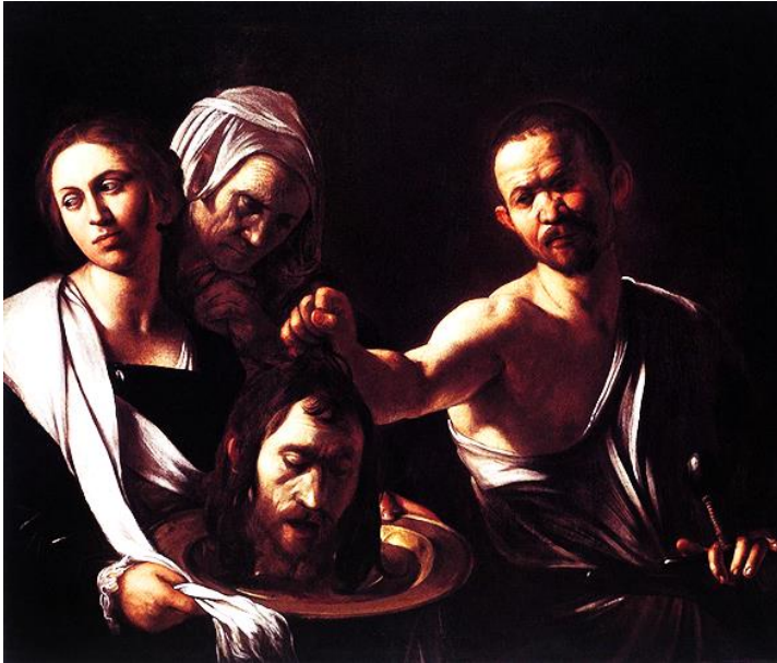
Salome with the Head of John the Baptist, Michelangelo Merisi da Caravaggio, c.1607

Saint John followed in the footsteps of the great prophets of the Old Testament, calling upon the people to repent and be ready for the coming Messiah. He baptised with water but spoke of the one who would baptise with the Holy Spirit (Matthew 3:11). He pointed Jesus out as the promised Lamb of God (John 1:35-37) and baptised him (Matthew 3:13-17). He had a great following among the people but he always directed away from himself and lived an ascetic lifestyle. His life was centred on God and on his calling. Herod, despite being fearful of John’s popularity among the people, had John beheaded after an oath he made to Herodias at his birthday party (Matthew 14:1-12).