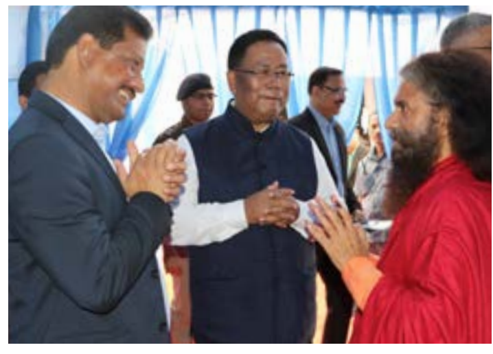
Pujya Swamiji meets the Hon'ble PHE Minister of Assam Rihon Daimari and officials to discuss WASH in Assam.