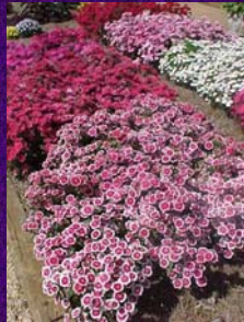
Dianthus barbatus 'Telstar Series

Culture Concerns: Trim to shape in spring of 2 nd year