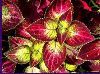
Coleus 'Solar Flare'