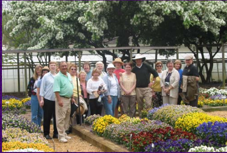
Macon Master Gardeners Visiting UGA