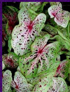
Caladium 'Miss Muffet'

Culture Concerns: Well drained Dig tubers in fall