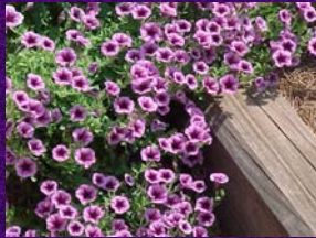
Petunia hybrida 'Cascadia'