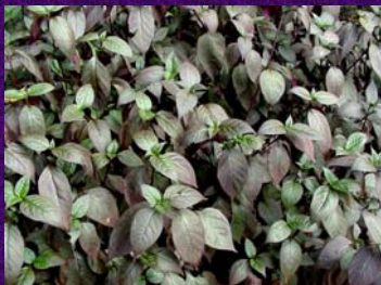
Alternanthera dentata 'Wave Hill'