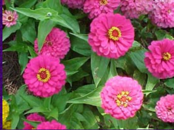
Zinnia 'DreamLand' Series