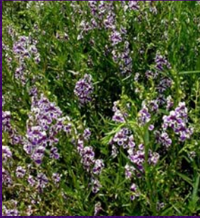
Angelonia angustifolia 'Angel Mist'