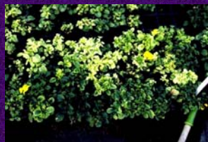
Overdose of a common fertilizer