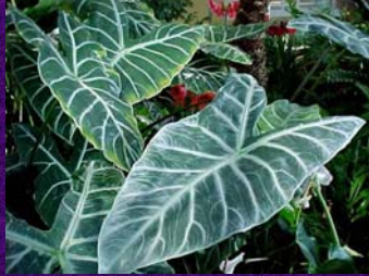
Alocasia micholitziana 'Maxkowskii'