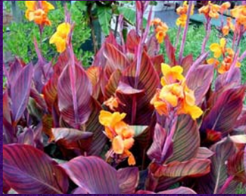
Canna x hybrida

Culture Concerns: Pull flower canes Leaf rollers Lift tubers in fall