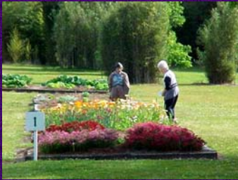
The Trial Gardens At The Coastal Gardens, Savannah