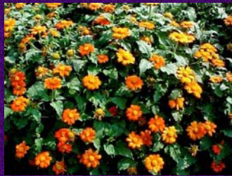
Tithonia rotundifolia 'The Torch'