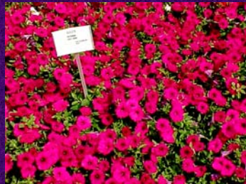
Petunia 'Purple Wave'