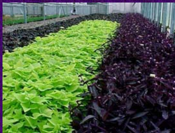
Ipomea batatas 'Marguerite' & 'Blackie'

Culture Concerns: Chewing insects Rampant growth