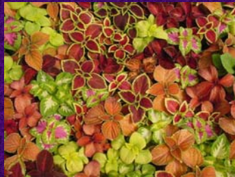
Coleus 'Wizard Mix'

Culture Concerns: Pinch at transplant Mildew