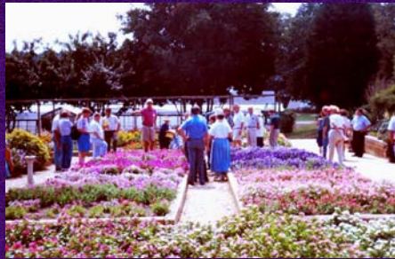
Annual Open House at the UGA Trial Gardens