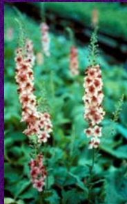
Verbascum 'Southern Charm'

Culture Concerns: Mites Deadheading essential