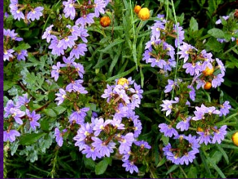
Scaveola aemula 'New Blue Wonder'

Culture Concerns: Must be kept moist Early season pinch