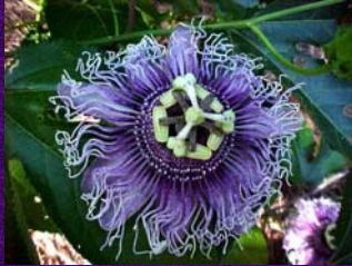
Passiflora 'Byron's Beauty'

Culture Concerns: Sterile/not invasive Caterpillars?