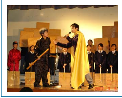
Old Man Yu and the Mountains performed by Form 2 students

My colleagues are also involved in preparing the students and helping them to improve their presentation skills and pronunciation. I work with various classes to get them started and then their class teachers take over and guide the students through the preparation and rehearsal.