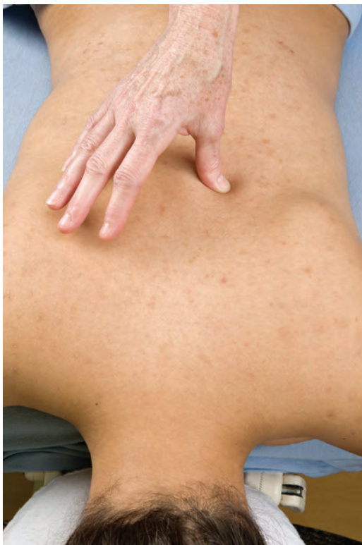
• FIGURE 1-2 Pressure to a trigger point.

healing resort. They spent the years between the late 1930s and early 1940s testing and developing these theories and techniques. The techniques they used then very closely resemble the techniques we use today. Lief's idea of neuromuscular therapy (called "neuromuscular techniques" in Europe) incorporated a holistic approach to healing by using nutrition, psychology, hydrotherapy, and soft tissue manipulation. 1 Lief's methods eventually became incorporated into the training system at the British College of Naturopathy and Osteopathy.