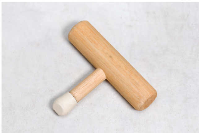
● FIGURE 1-3 T-Bar pressure bar. Pressure bars are wooden tools with rubber or plastic tips that can be used to apply pressure into the tissues.

a small amount of drag against the skin is required for this. Most nerve endings are at the level of skin. If you do not use a small amount of friction against the skin when treating an area, you will miss the opportunity to treat tissue and bone directly below that area. Certain techniques, however, are performed on dry skin to increase effectiveness. For example, when using any myofascial release techniques during a session, begin with them so they can be done before lubricating for best effectiveness.