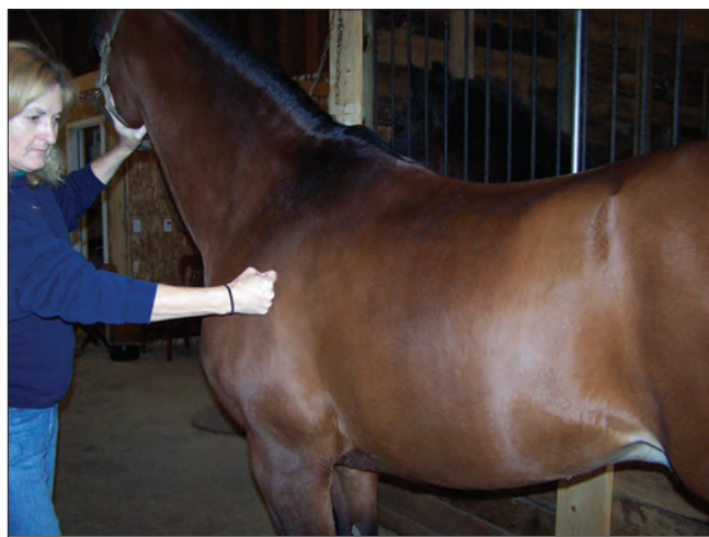
● FIGURE 1-1 Horse receiving neuromuscular therapy. Even horses have trigger points that can be effectively deactivated using neuromuscular therapy.

Lengthening techniques such as myofascial release, deep effleurage, muscle stripping, and passive stretching are performed to help break the concentric strain , or chronically, pathologically shortened muscles. A concentric contraction occurs in a muscle when both ends of the muscle are brought closer together, shortening the muscle during the active phase of muscle contraction. Trigger point pressure or a pincher technique is used to deactivate the trigger points formed in the soft tissues (Fig. 1-1). Once a client is able, practitioners add active stretching to the treatment schedule. This helps the client to increase range of motion , or the