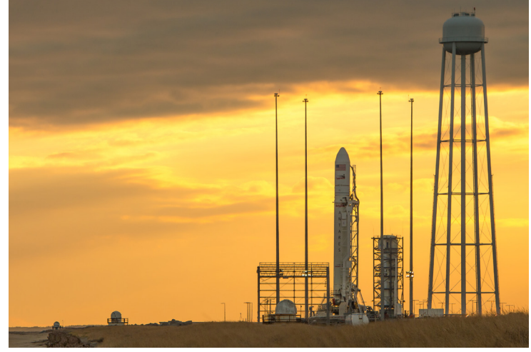
The Mid Atlantic Regional Spaceport is located at Goddard's Wallops Flight Facility in Wallops Island, Virginia.

NASA uses sounding rockets because they are simple, quick and cost-efficient platforms for conducting preliminary research and testing. These suborbital missions send payloads into space for a brief amount of time, typically under 30 minutes. In some cases, the payload returns to Earth on a parachute and can be recovered.