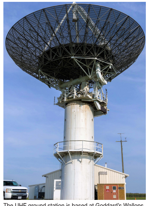
The UHF ground station is based at Goddard's Wallops Flight Facility.