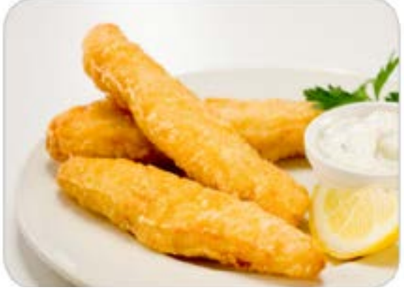
Cod made using Fish & Chips Batter