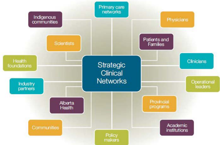
Figure 1 Network stakeholders

Alberta Health Services (AHS) launched its first clinical networks in 2012, with an emphasis on patient engagement and rigorous adherence to implementation science and evidence-based practice. There are currently 16 Strategic Clinical Networks (SCNs), each focusing on a specific area of health (Figure 2) and partnering with stakeholders across the health spectrum.