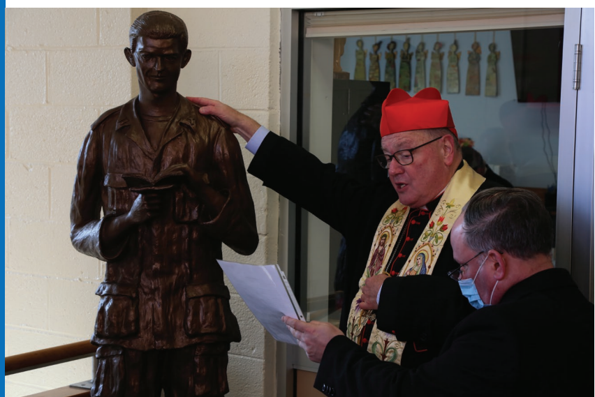
On January 21, 2021, Cardinal Timothy Dolan visited the newly merged Father Vincent Capodanno Catholic Academy to cut the ribbon and bless both the school and Father Capodanno statue.