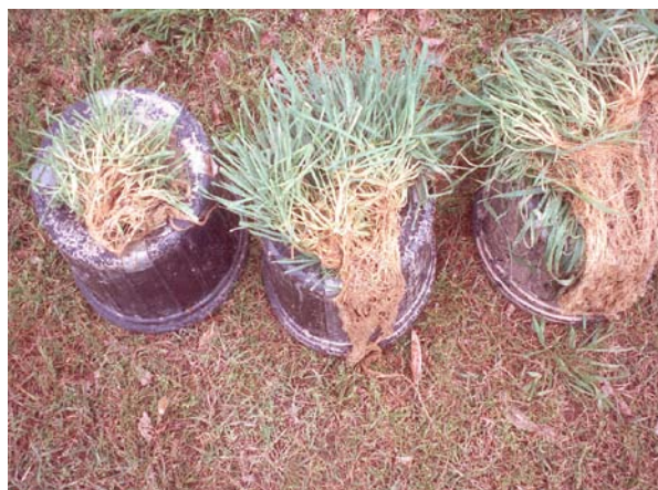
Figure 2. Potted plants were clipped to mimic continuous grazing and various levels of rotational grazing. The plant on the left, representing continuous grazing remained much shorter due to the constant removal of leaf and the impact on the root system was very detrimental. The Plants grazed less often maintained more leaf area and a larger and denser root mass.