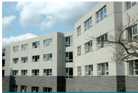
Single Student Residence