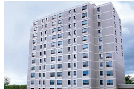
Mature Student Residence