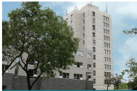
University College Residence