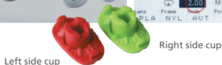
Left side cup