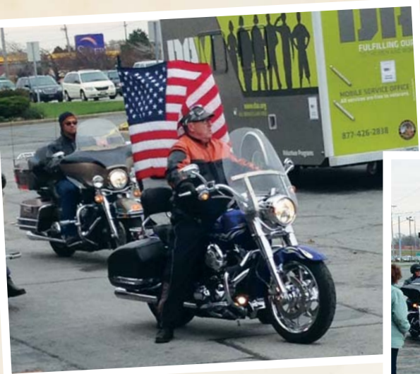
Saturday, November 8th, we honored 14 veterans at the Mad River Veterans Day event.