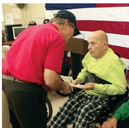
We honored 18 Veterans on Tuesday, November 11th at Providence Care Center.