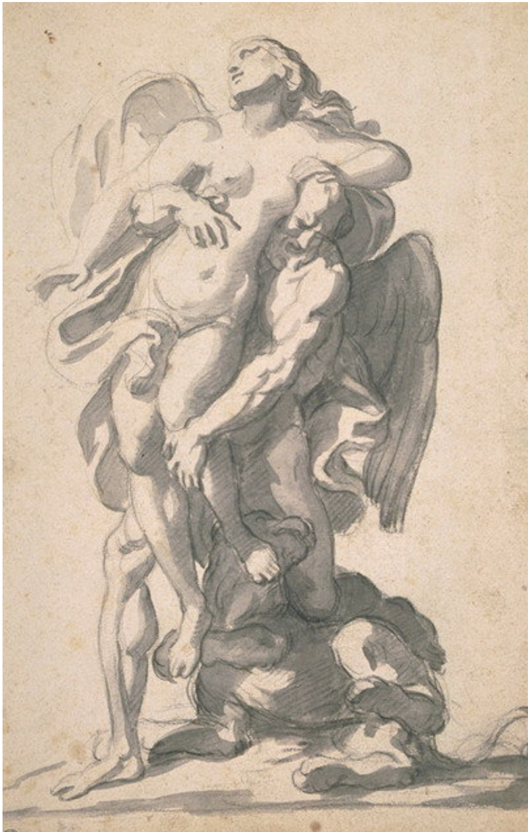
(fig. 10) Charles Le Brun, Saturn abducting Cybele , c. 1654–74, Musée du Louvre, Paris