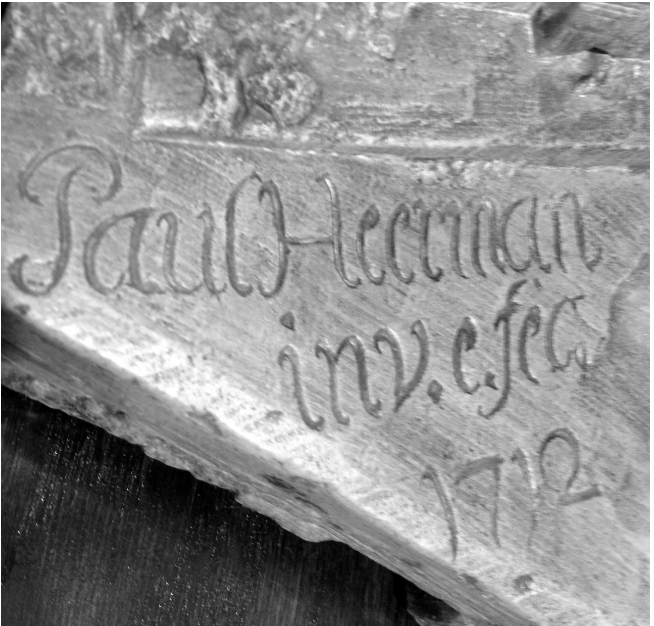
(fig.9) (detail) Inscription from Laurel Coronation , 1712