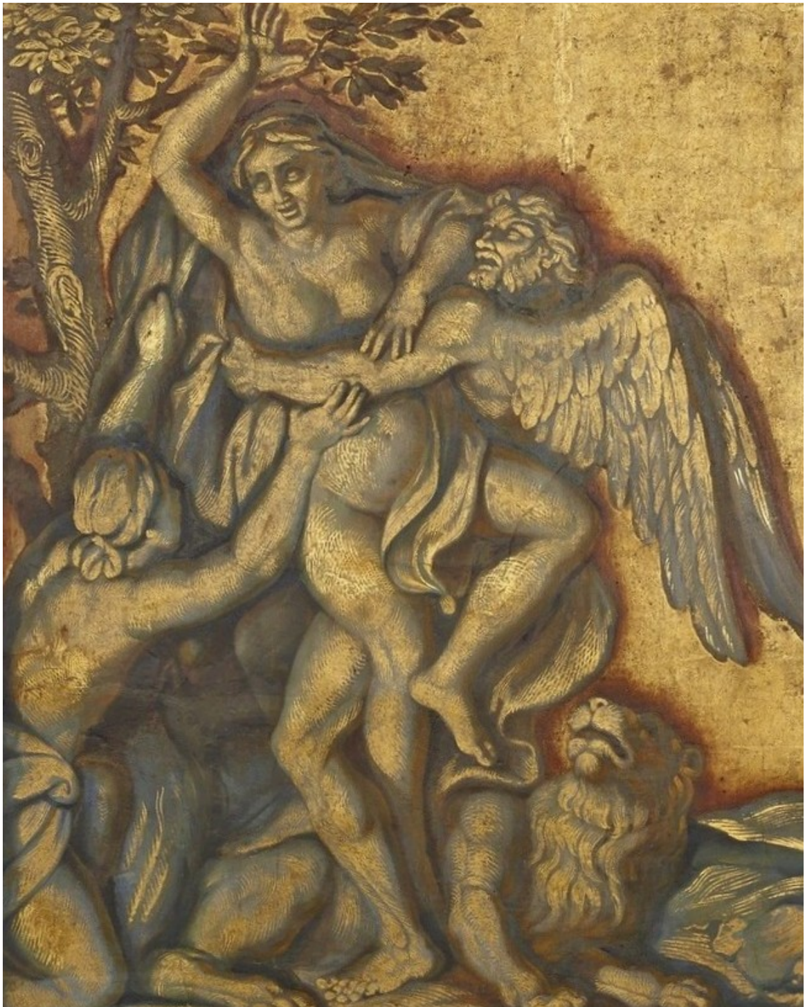
(fig.11) René-Antoine Houasse, Saturn abducting Cybele , 1676, Château de Versailles