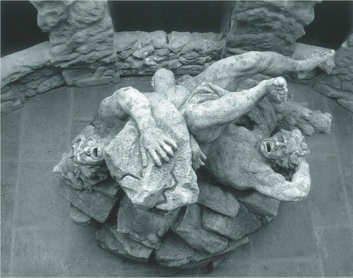
(fig.2) Johann George Heermann, Fallen Giants , external staircase of Troja Castle, Prague