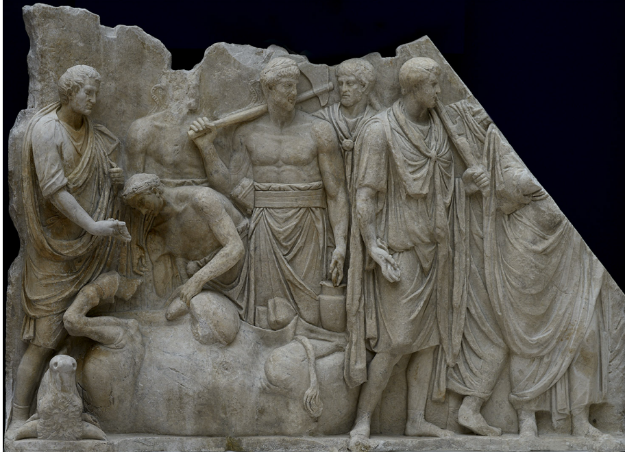
Haruspex; stone-relief in the Louvre; Inv. No. MR 737 (MA 978).

This stone relief is from the Forum of Trajan, an emperor of Rome from 98–117 CE. Examine the scene depicted in this carving.