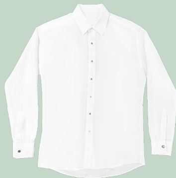
MODERN / FITTED