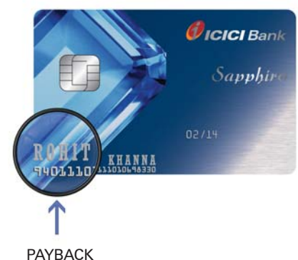
PAYBACK membership number