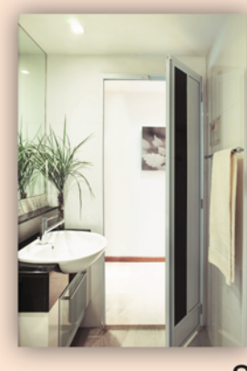
The Method of Closing PD Door